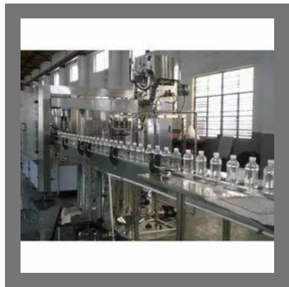
Packaged Drinking Water Plant