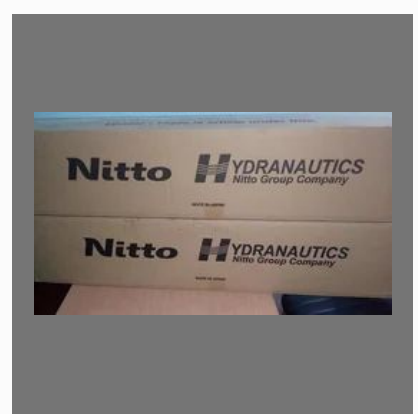
Hydronutics Membrane 75 GPD