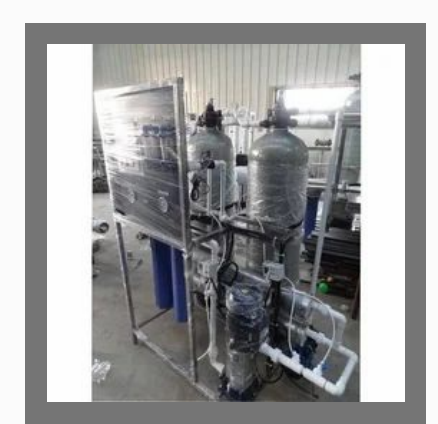
Reverse Osmosis System