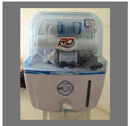
RO UV Alkaline Water Purifier