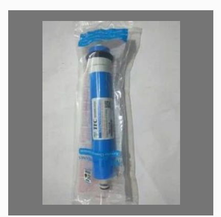
Micro TFC 75 GPD Membrane