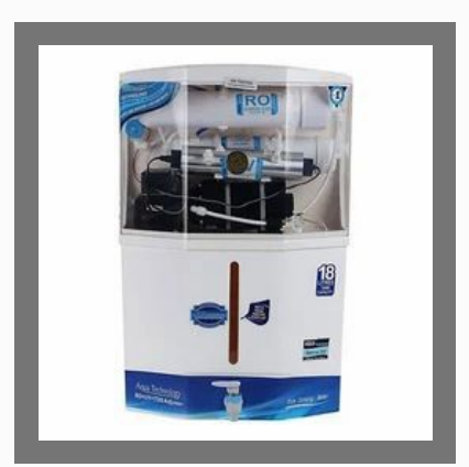
Aqua Supreme Water Purifier