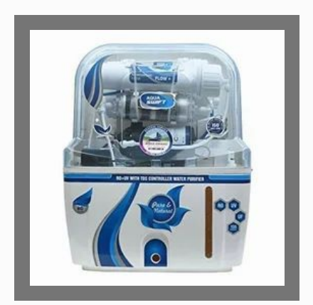
Aqua Swift Water Purifier