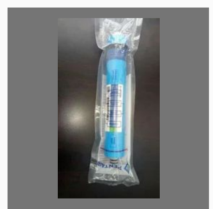
Pentair 75 GPD