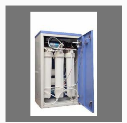
RO 100 LPH Water Treatment Plant