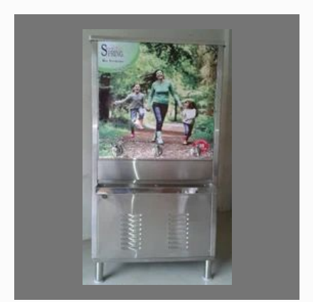
Stainless Steel Cooler 200 Ltr