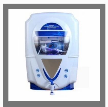
Nexa Grand Type Water Purifier