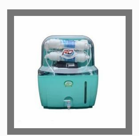
Domestic RO UV Alkline Purifier