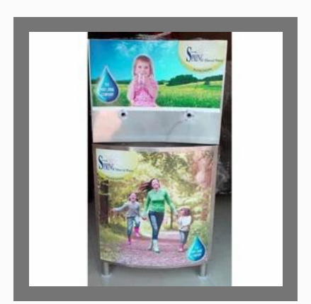
RO Water Cooler