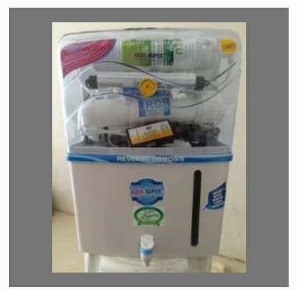
RO UV Alkline Water Purifier