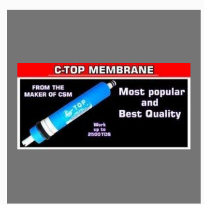
C-Top 80 GPD Membrane