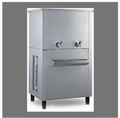
Premium Water Cooler