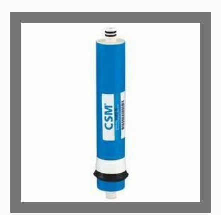
CSM 75 GPD Membrane