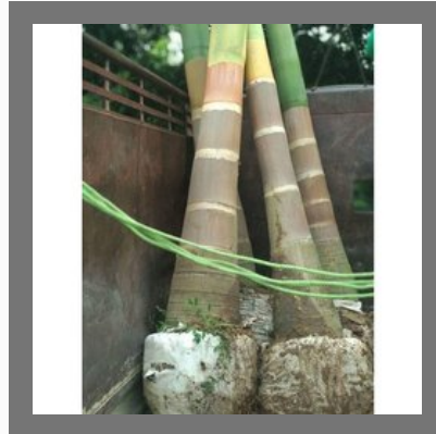
Bottle Palm Plant