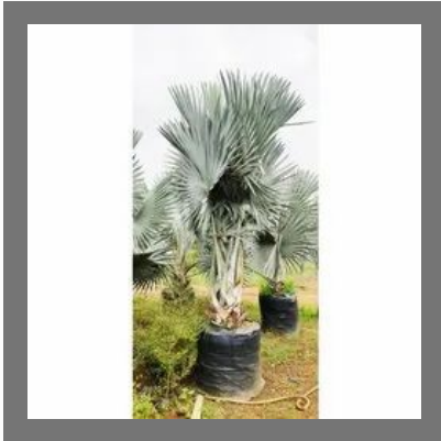
Bismarkia Palm Plant