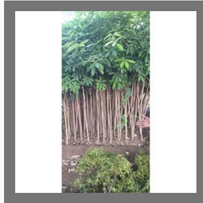
Alashtonia Road Side Plant