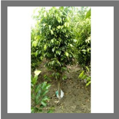
Black Ficus Plant