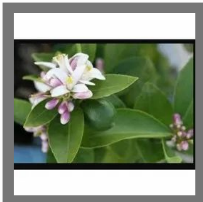
Seedless Lemon Plant