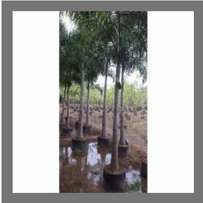
Foxtail Palm Plant