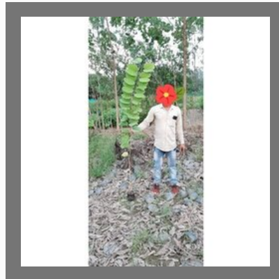
Kachnar Road Side Plant