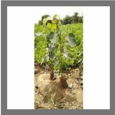
Peepal Plant Timber