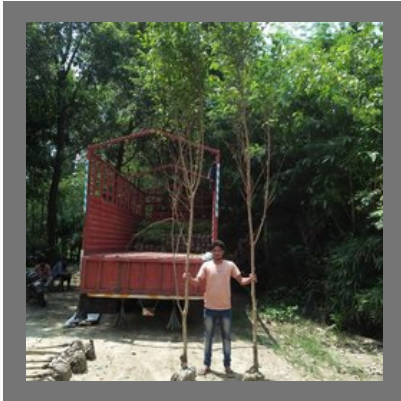
Ficus Benjamina Green Plant