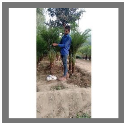
Phoenix Palm Plant