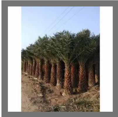
Date Palm Khajur Plant