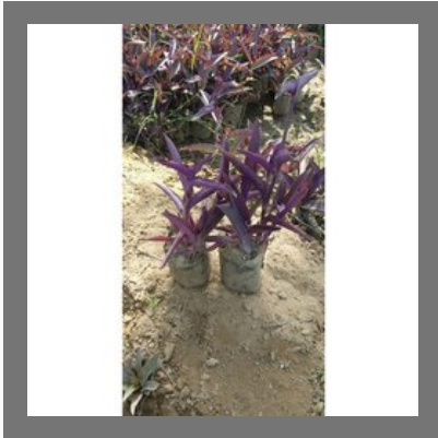
Vertical Cancova Plant