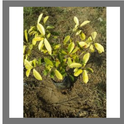
Ficus Panda Plant