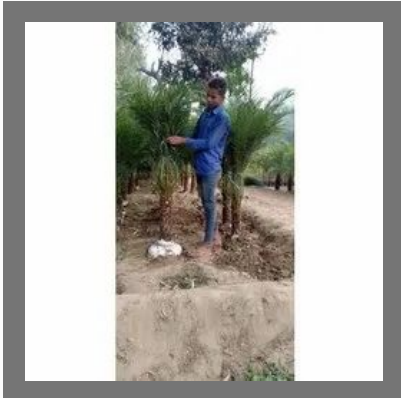
Phoenix Palm Plant