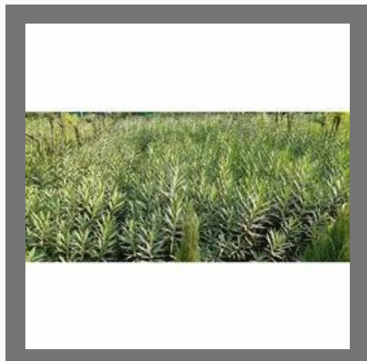
Kaner Road Side Plant