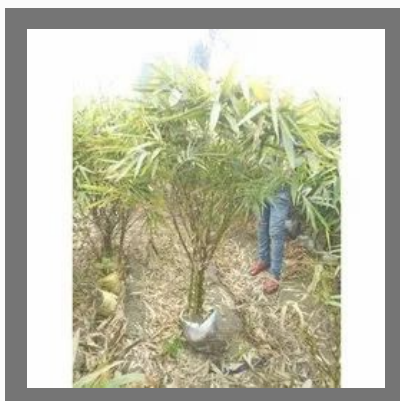
Buddhabelly Bamboo Plant