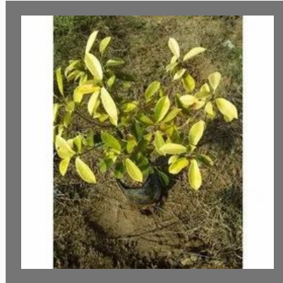
Ficus Panda Plant