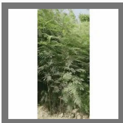
Silver Oak Timber Plant