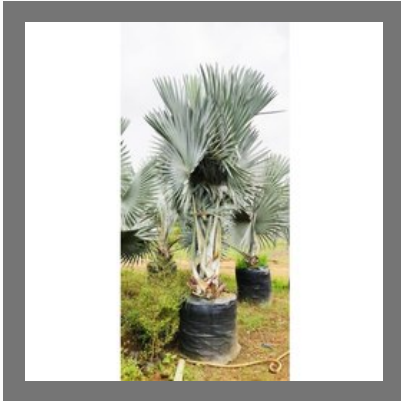
Bismarkia Palm Plant