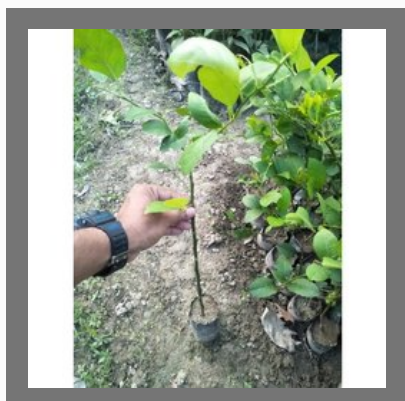
Lemon Kagzi Plant