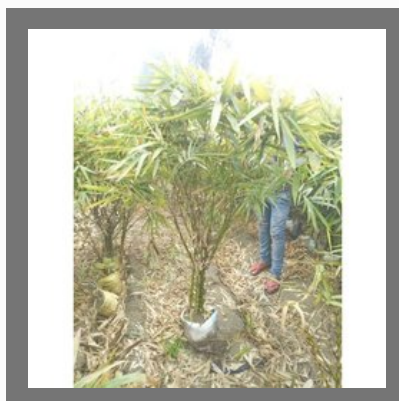
Buddhabelly Bamboo Plant