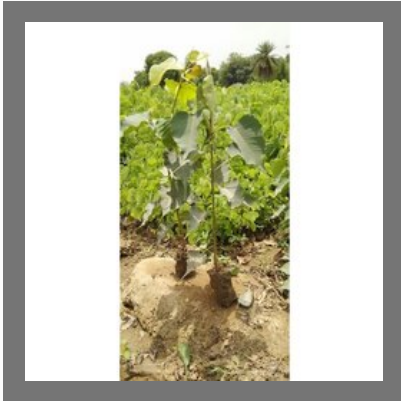
Peepal Plant Timber