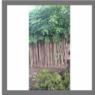
Alashtonia Road Side Plant