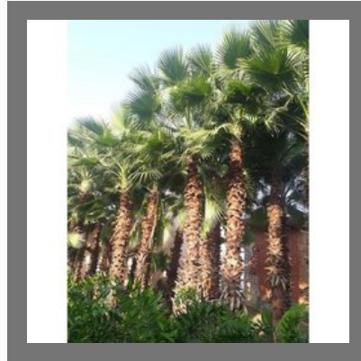
Washington Palm Plant