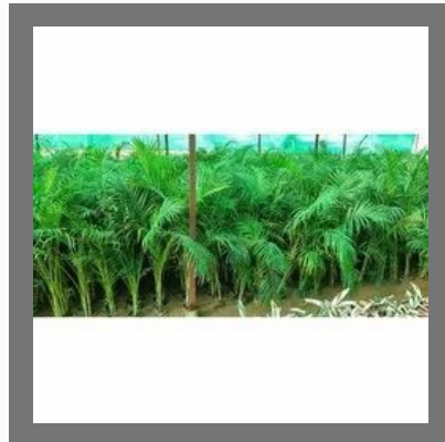
Areca Palm Plant