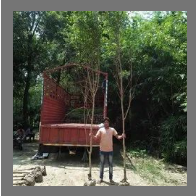
Ficus Benjamina Green Plant