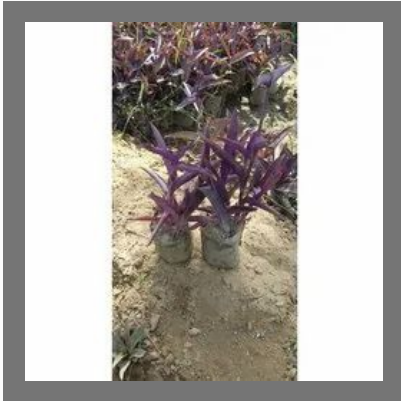
Vertical Cancova Plant