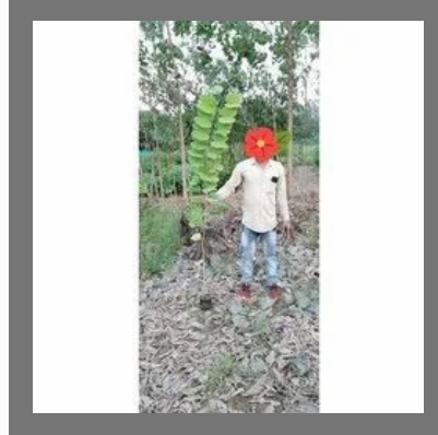
Kachnar Road Side Plant