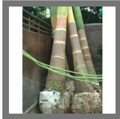
Bottle Palm Plant