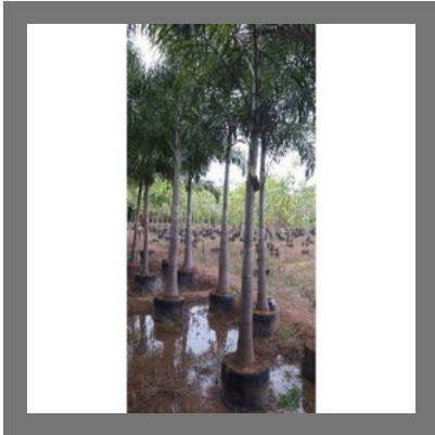
Foxtail Palm Plant