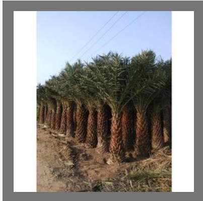
Date Palm Khajur Plant