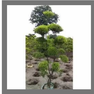
Golden Bottle Brush Plant