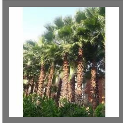
Washington Palm Plant