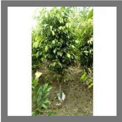
Black Ficus Plant