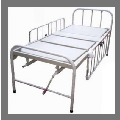
Hospital Cot Bed