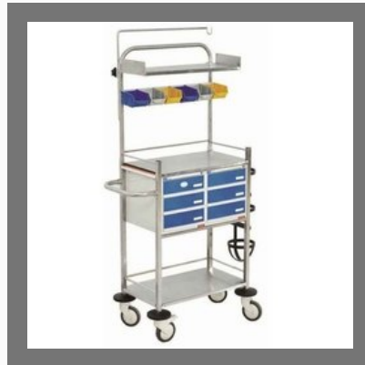
Medicine Crash Cart Trolley