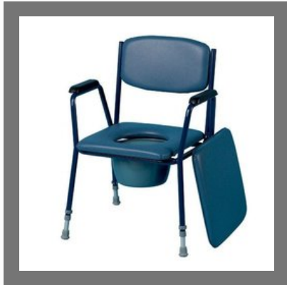
Padded Commode Chair