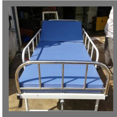
Patient ICU Bed