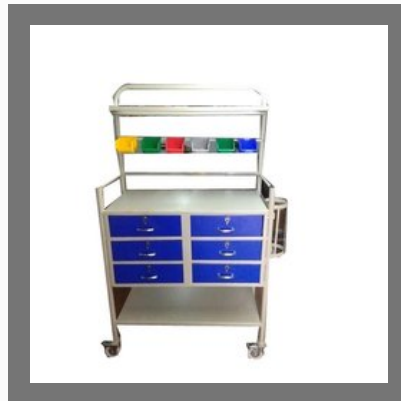
Hospital Crash Cart Trolley