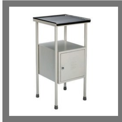
Hospital Bedside Cabinet Table