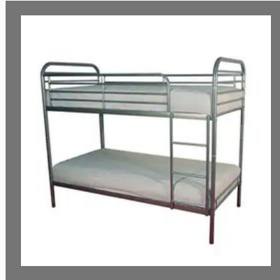
SS Hospital Bunk Bed