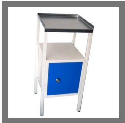
Hospital Bedside Locker