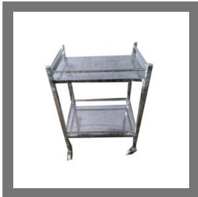
Stainless Steel Hospital Trolley