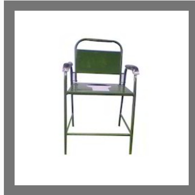
Stainless Steel Commode Chair