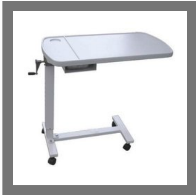
Hospital Cardiac Table