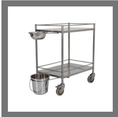
Hospital Dressing Trolley