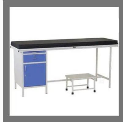
Hospital Examination Table