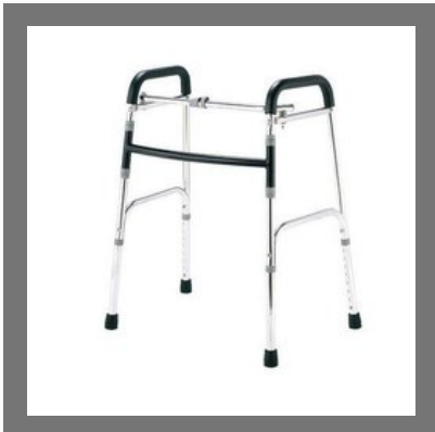
Bariatric Two Button Folding Walker