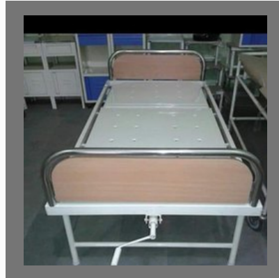
SS Hospital Folding Cot Bed