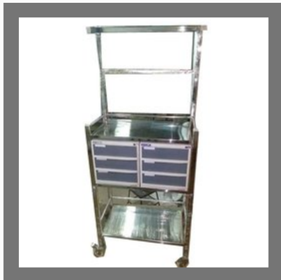
Stainless Steel Crash Cart Trolley