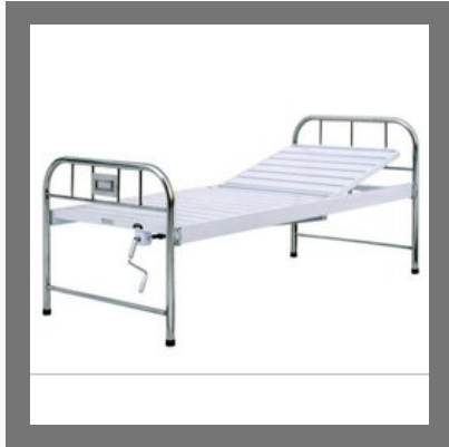
Hospital Adjustable Bed