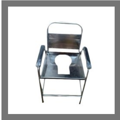
Hospital Commode Chair