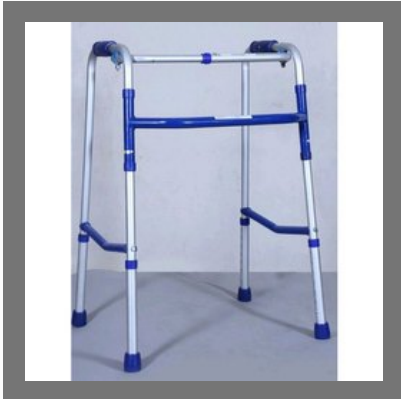
Aluminum Patient Walker