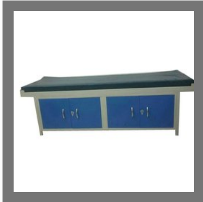
MS Examination Table