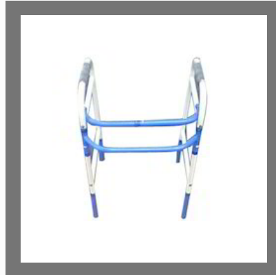
Patient Movable Walker