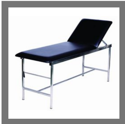
Clinic Examination Table