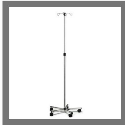
Hospital IV Stand