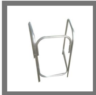
Stainless Steel Walker