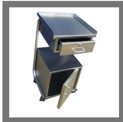
Hospital Stainless Steel Bedside Cabinet