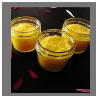
A2 Gir Cow Bilona Ghee