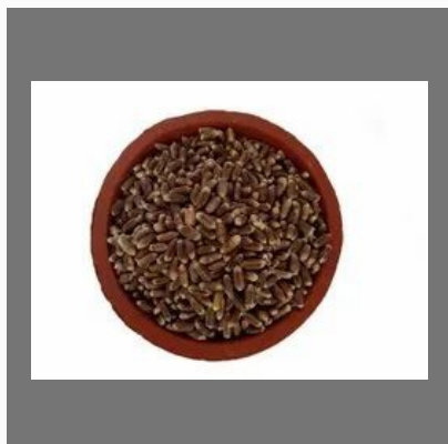
Black Wheat Grains