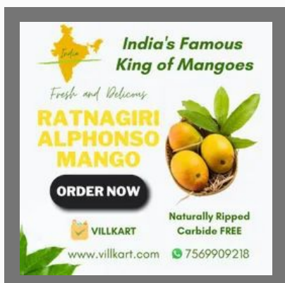
Ratnagiri Alphonso Mangoes