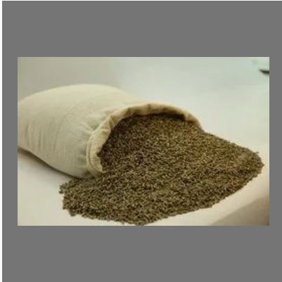
Black Wheat Seed