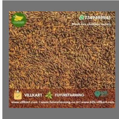
Black Rice Seeds