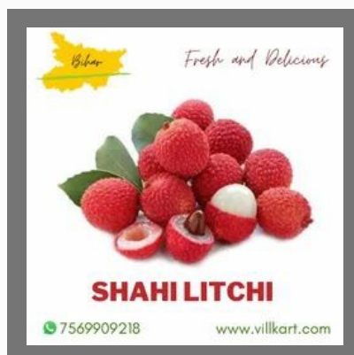
Fresh Shahi Litchis