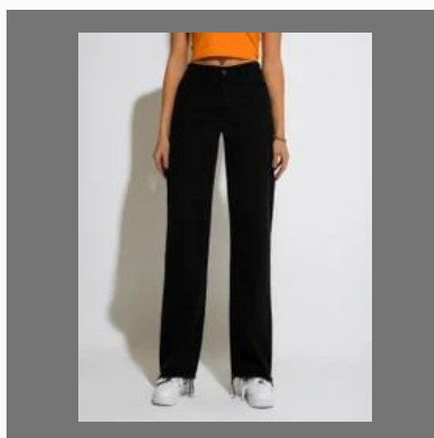
Women High Waist Straight Fit Denim Jeans