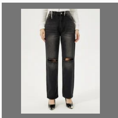
Miracle wide leg damaging jeans