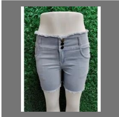
Women Plain Denim Shorts