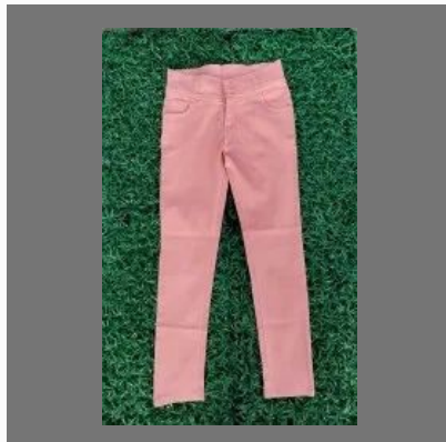
Women Plain Denim Jeans