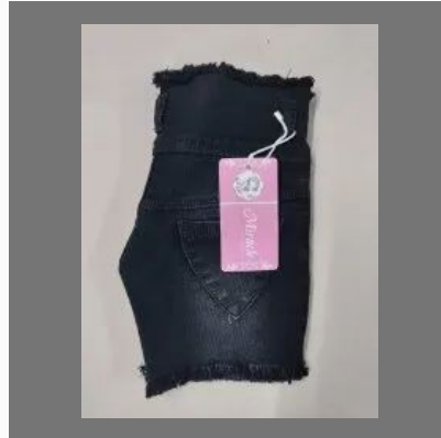
Ladies Denim Shorts