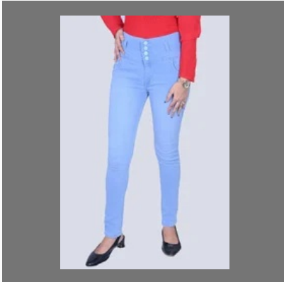
4 Button Girls Jeans