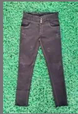
Black Plain Faded Denim Jeans with damaging work