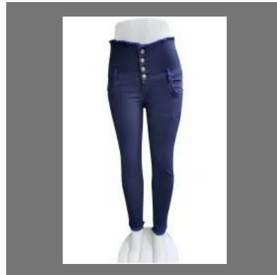
Navy Blue Plain Denim Jeans