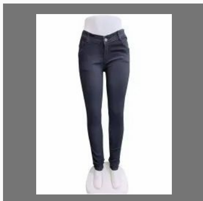
Women High Waist Denim Jeans