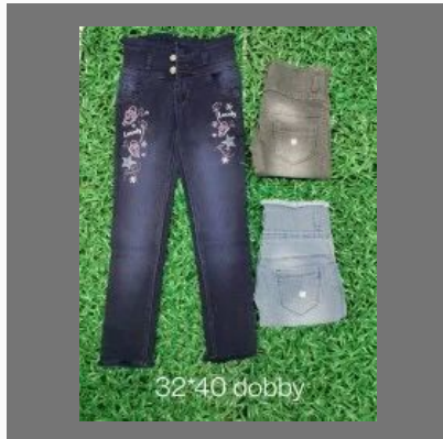
2 buttonembroidery worksprey wash jeans