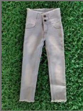
Casual Wear Women Denim Jeans