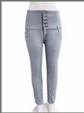
Women Gray Denim Jeans