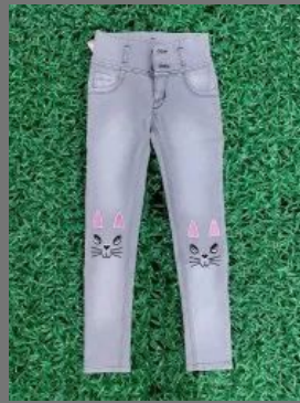
Casual Wear Printed Denim Jeans