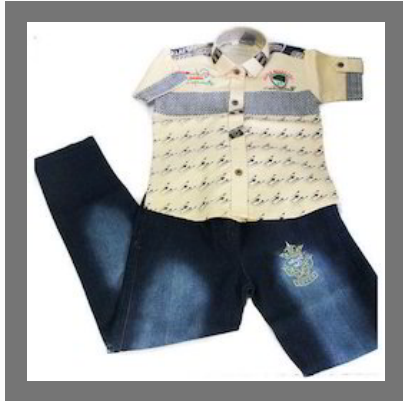
Stylish Boys Dress