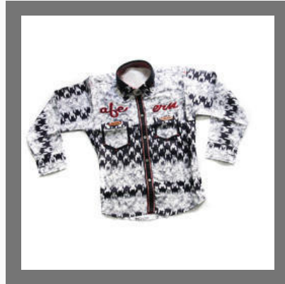
Kids Collar Shirt