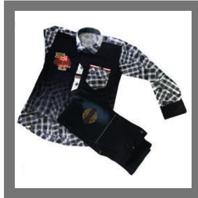
Fancy Boys Dress (Shirt and Jeans)