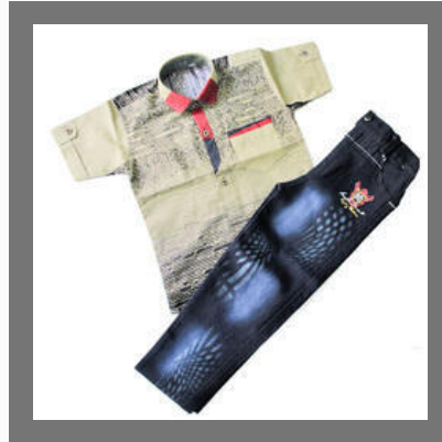
Kids Casual Wear