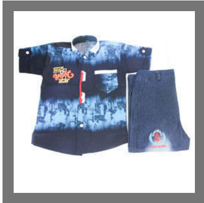
Kids Fashion Wear