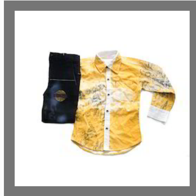
Kids Fancy Dress Set