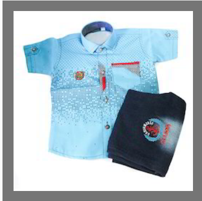
Kids Trendy Wear