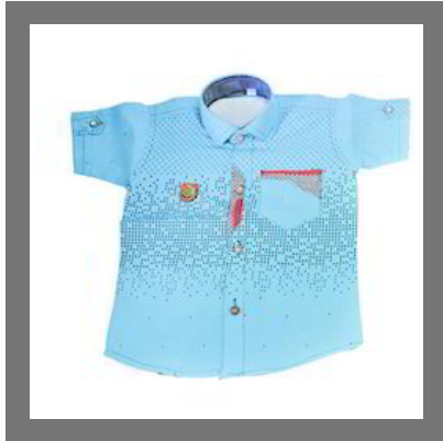
Kids Half Sleeve Shirt