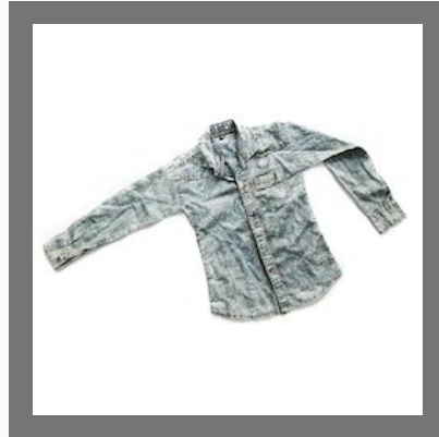
Kids Denim Shirt