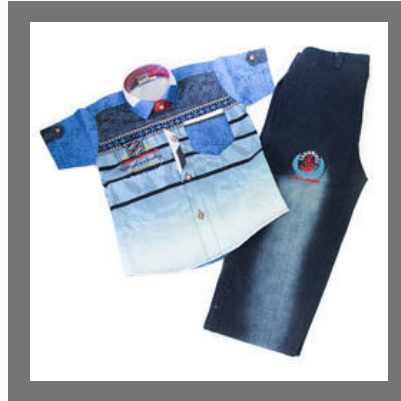
Casual Boys Dress