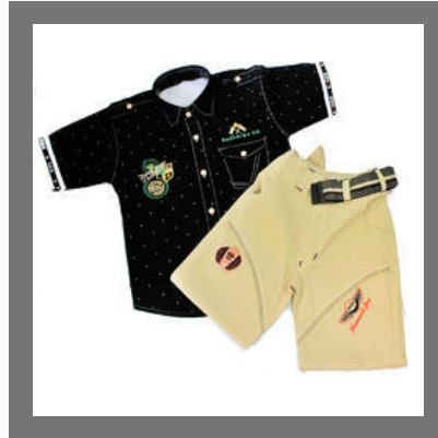
Kids Stylish Wear