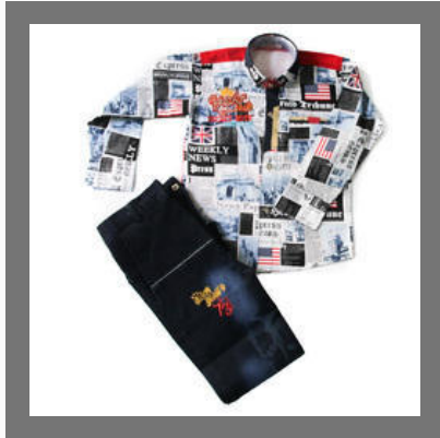
Kids Western Wear