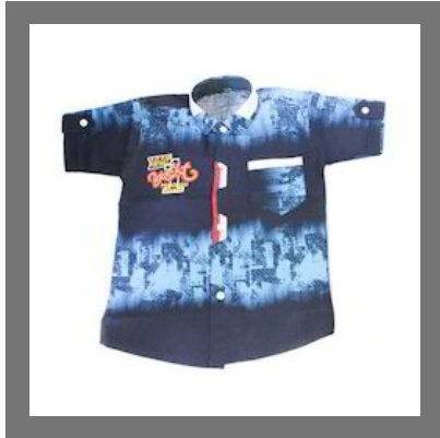
Kids Casual Shirt