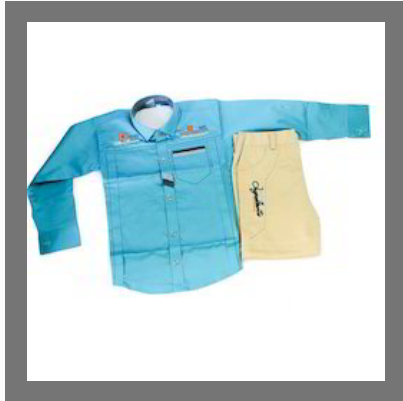
Trendy Boys Dress (Shirt and Pant)