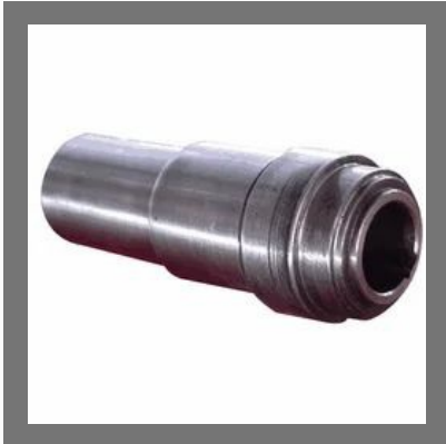
Chemical Pump Sleeve