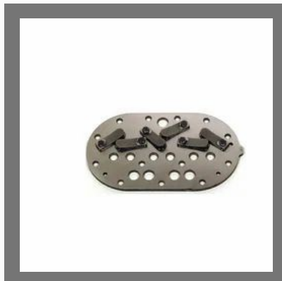
Compressor Valve Plate