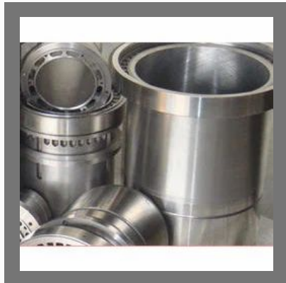
Compressor Cylinder Liner Assembly