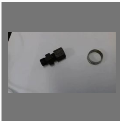
Hydraulic Pipe fittings