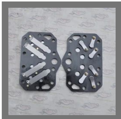
Air Compressor Valve Plate