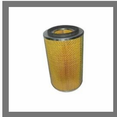
Compressor Air Filter