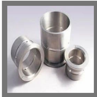
Compressor Bush Bearing