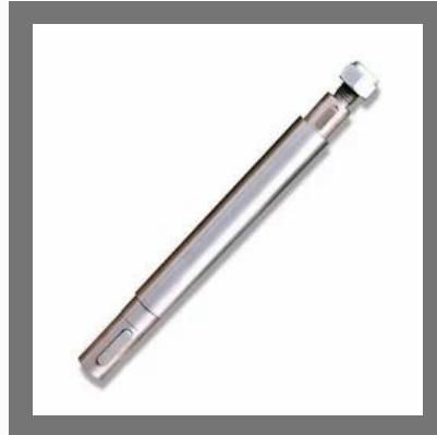
Chemical Pump Shaft