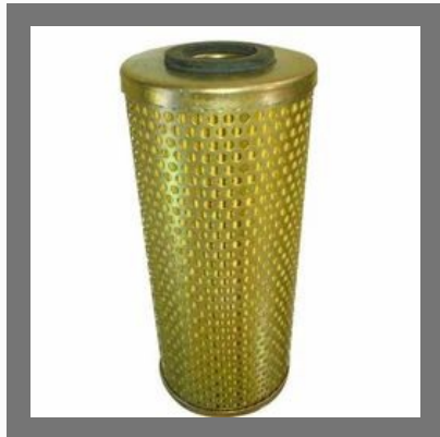
Compressor Paper Filter