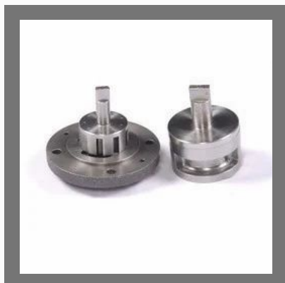
Compressor Oil Pump