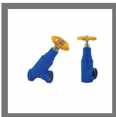
Refrigeration Control Valve