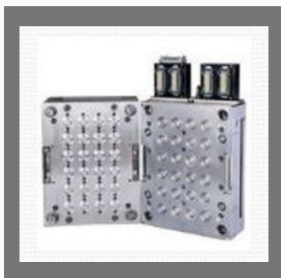
Cap And Closer Moulds