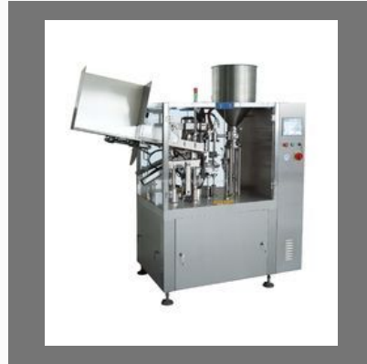
Pharma Tube Making Plant