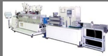
Plastic Tube Production machine