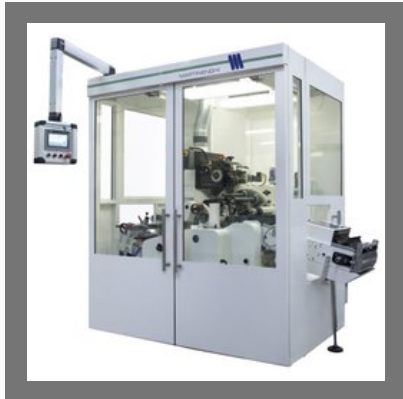
Aerosol Can Making Plant