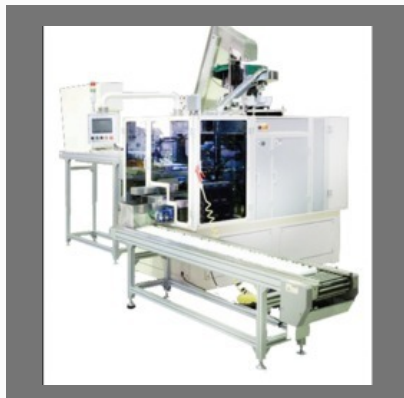
Fully Automatic Capping machine