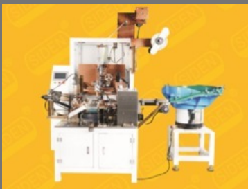
Shrink Sleeve Machine