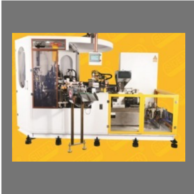
Laminated Tube Making Machine