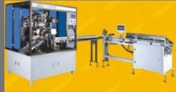
Hot Stamping Machine