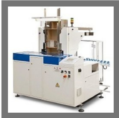
Packing Machine SC40