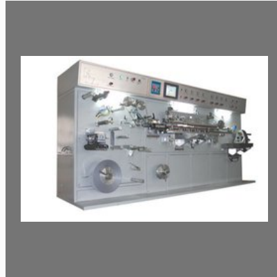
Laminated Tube Making Machine