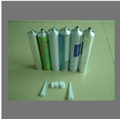
Aluminium Collapsible Tube