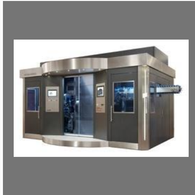
Digital Printing Machine For Aerosol Can