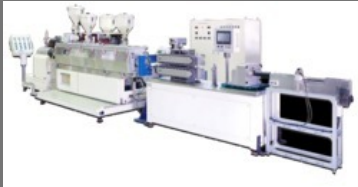
Tube Extrusion Machine