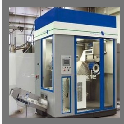
Leak Control Machine LC 200 for Aerosol Can Making Plant