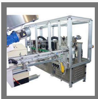
Printing Machine for Metal And Plastic Cap