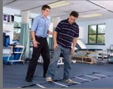
Orthopedic Treatment Facility