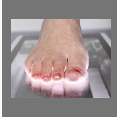
Foot Scan Facility