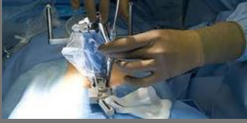
Neurology And Spine Surgery Facility