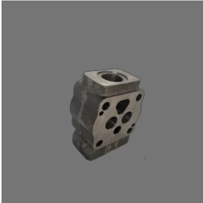
Hydraulic Pump Bodies