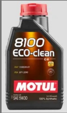
Motul Engine Oil 8100 Eco-Clean 5W-30