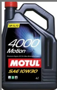
Motul Engine Oil 4000 Motion 10W-30