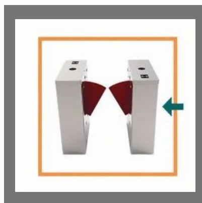
Retractable Flap Barrier (SPAC-RFB)