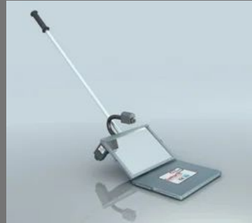
Under Vehicle Search Mirror