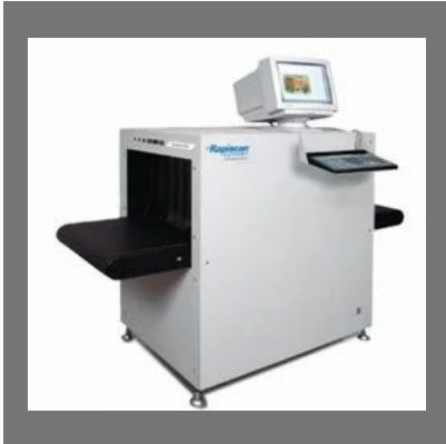
X-Ray Baggage Scanners