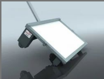
Under Vehicle Search Mirror