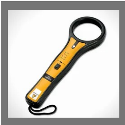
Hand-Held Metal Detectors - 103 CY