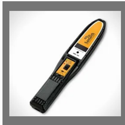
Hand-Held Metal Detectors - 101 A