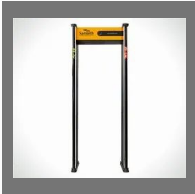
Walk-Through Metal Detectors- 106 F