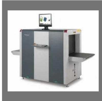
X-Ray Baggage Scanners