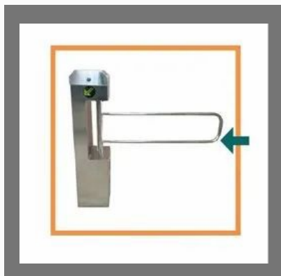
Motorized P-Type Swing Gate