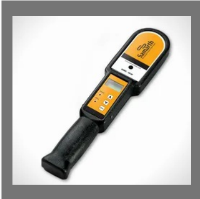
Hand-Held Metal Detectors - 101 AY