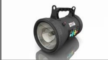
Hand Held Search Light