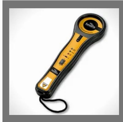
Hand-Held Metal Detectors - 103 C