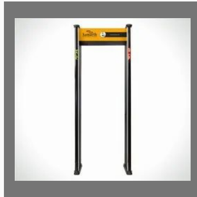
Walk-Through Metal Detector (Multizone) With Camera & Superimposed Data on Video- 106 F