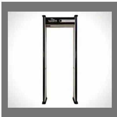
Walk-Through Metal Detectors - ASTRA