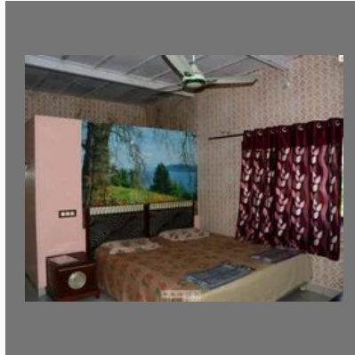
Non AC Room