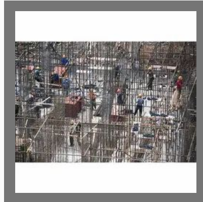
Steel Industrial Construction Service