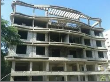
Light Gauge Steel Framing System