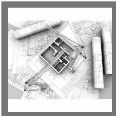
Structural Stability Certification Service