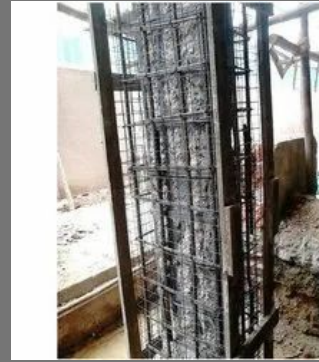
Building Structural Repair Service