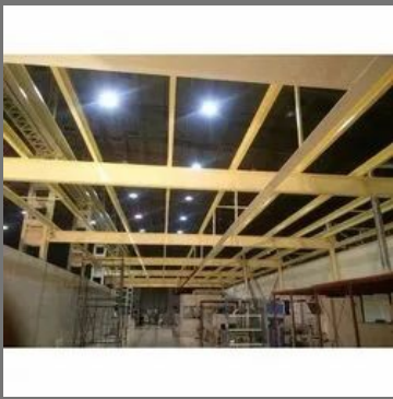
Industrial Steel Structure Designing Service