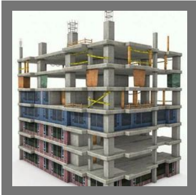
Light Gauge Steel Frame