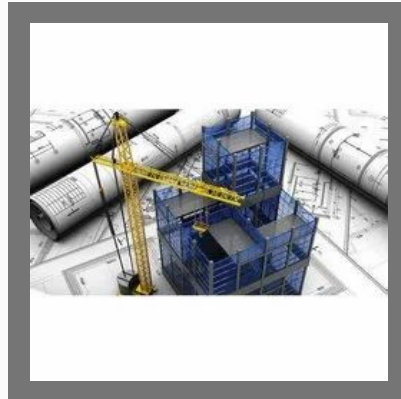
Structural Design Consultancy Service