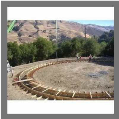
Underground Water Tank Construction Services