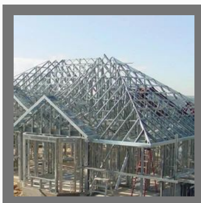
Structural Engineering Service