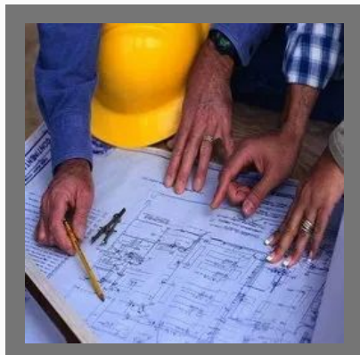
Structure Audit Services