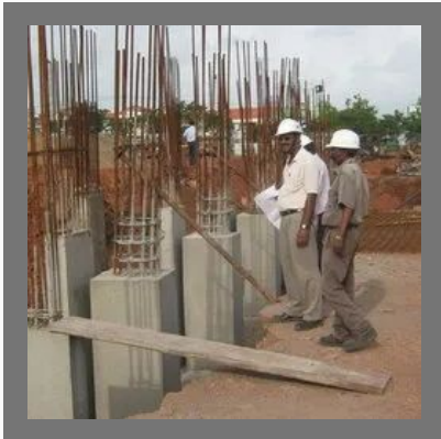
RCC Structural Design Consultants