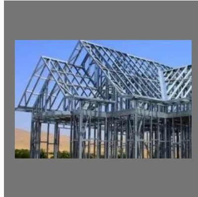
Structural Retrofitting Consultancy Service