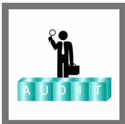
Structural Audit Services