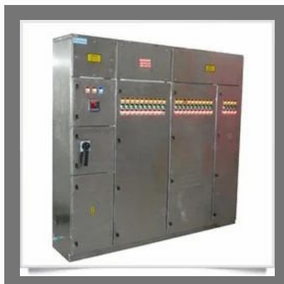
SS Panel Board Fabrication