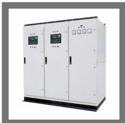
MS Panel Board Fabrication