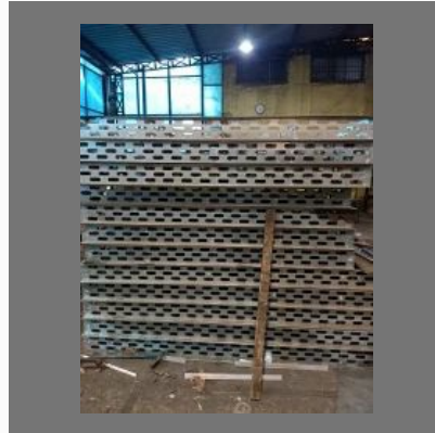
Ms Control Panel