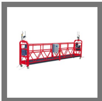
SRP800 Suspended Platform Hoist