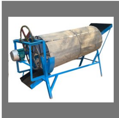
Rotary Sand Screening Machine