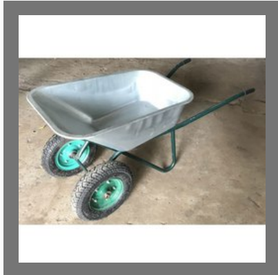
Double Wheel Barrow