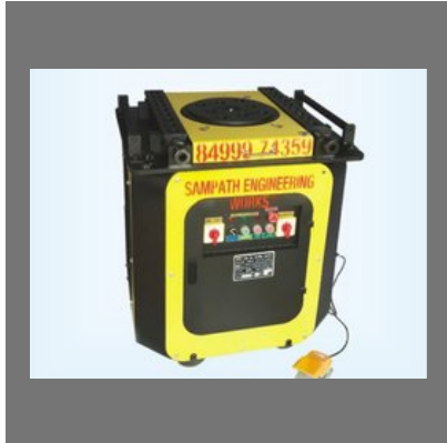
TMT Bar Bending Machine