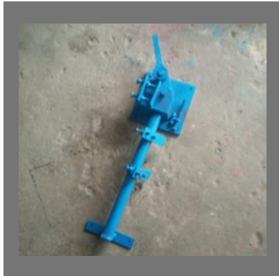
Manual Bar Bending Machine