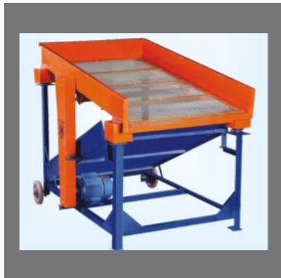
Vibro Sand Screening Machine