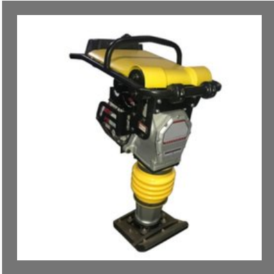
Vibratory Tamping Rammer