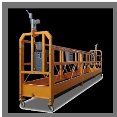
Suspended Platform Hoist