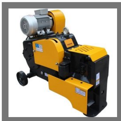
Tmt Bar Cutting Machine