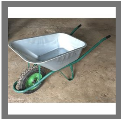
Single Wheel Barrow