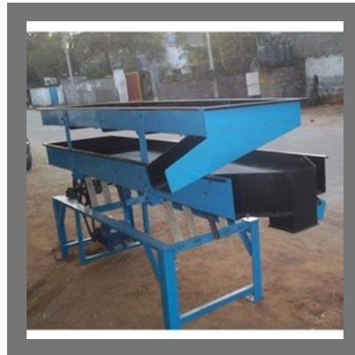
Bed Material Screening Machine