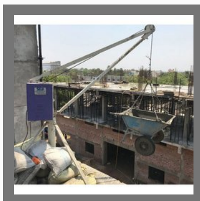
Monkey Hoist Machines