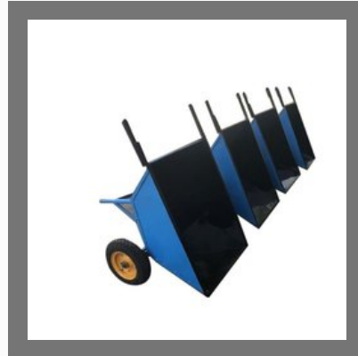
Heavy Duty Wheelbarrow