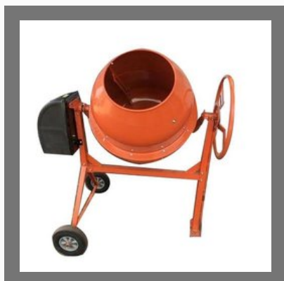
Mini Concrete Mixer