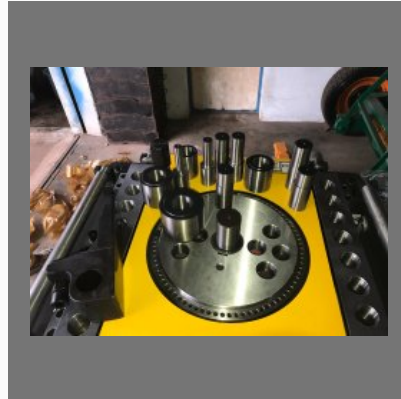
TMT Bar Bending Machine Spares