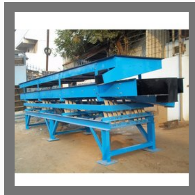
Electrical Sand Screening Machine