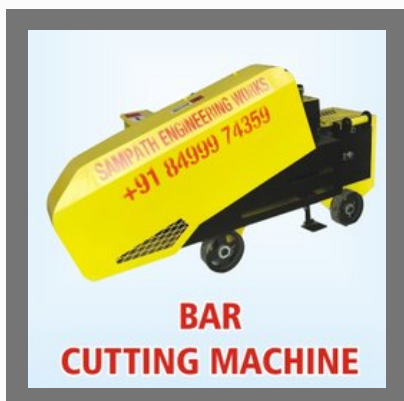
Bar Cutting Machine Spare