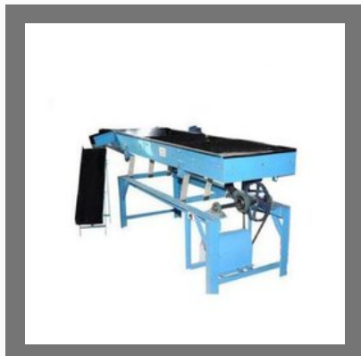
Sew Sand Screening Machine