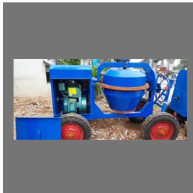
Manual Concrete Mixer