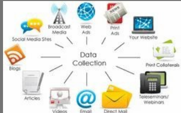
Database For Direct Marketing