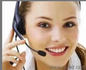
Database For Telecalling