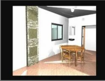
Flat Interior Work