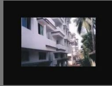
Building Construction Work