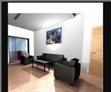
Flat Interior Work