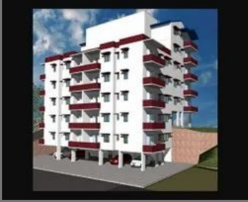
Building Construction Work