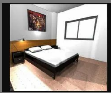
Flat Interior Work