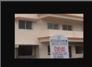
Building Construction Work