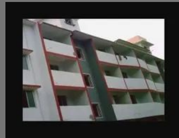
Building Construction Work