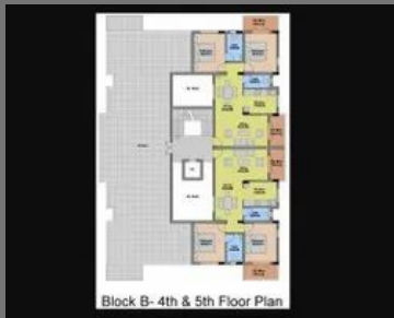
Construction Planning Service