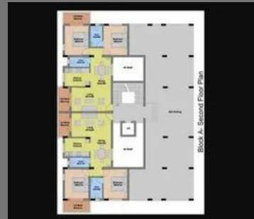
Construction Planning Service