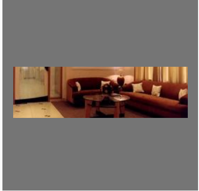
Interior Design Living Room