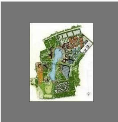
Concept Planning service