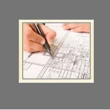
Detail Drawings Service