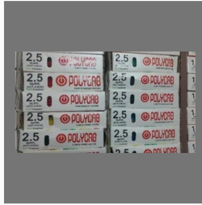
Polycab Flame Retardent Wire