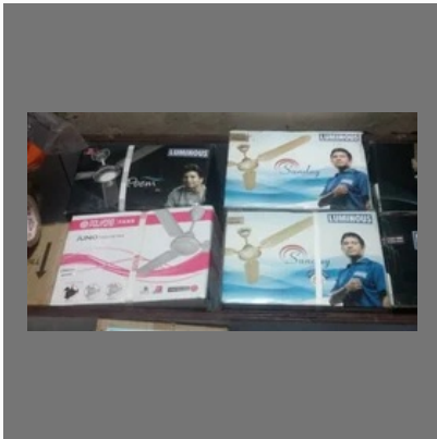
Luminous Ceiling Fans