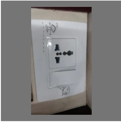
Luminous Electrical Switch