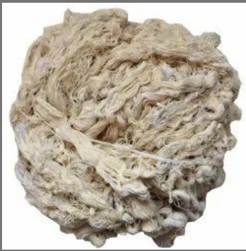
Cotton Selvedge Waste