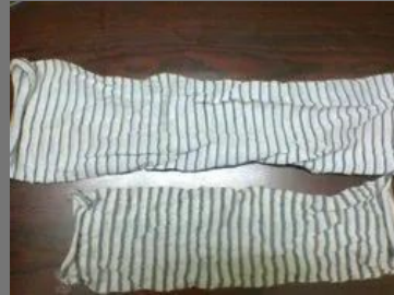
Cotton Banian Waste