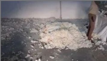
Polyester Cotton Yarn Waste