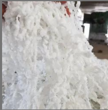
Polyester Yarn Waste