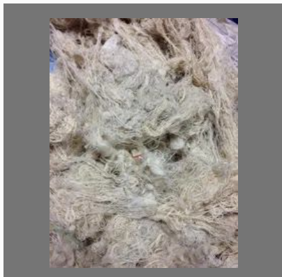
Grey Cotton Waste