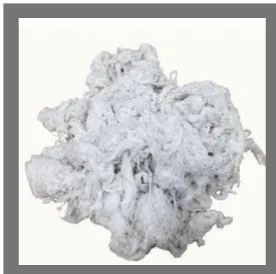
Off White yarn waste