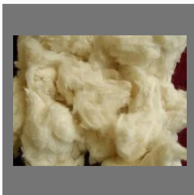
Bleached Comber Noil