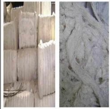
Cotton Yarn Waste