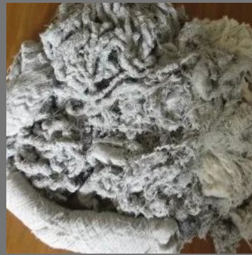
Cotton Melange Waste