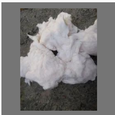
Cotton Comber Noil