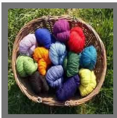
Colour polycotton Yarn