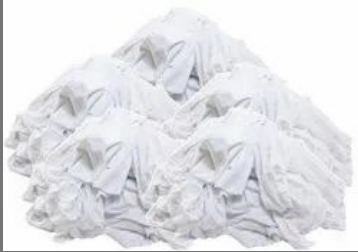
Cotton Waste Fabric