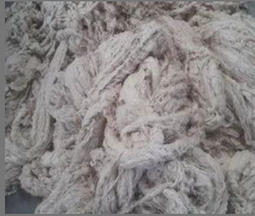
Viscose Yarn Waste