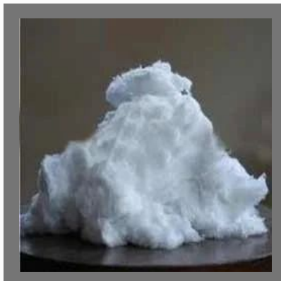
Milky White Cotton waste