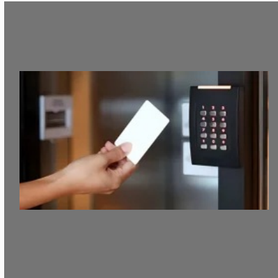
Access Control Systems