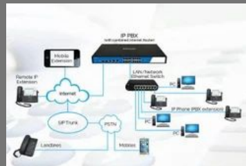
IP PBX Systems