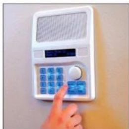
Commercial Intercom System