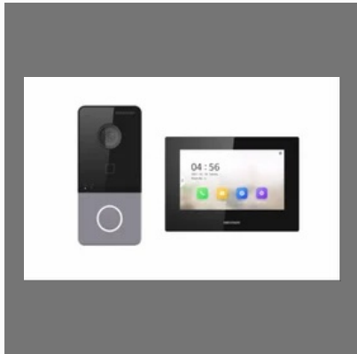
Hikvision Ip Video Door Phone Kit