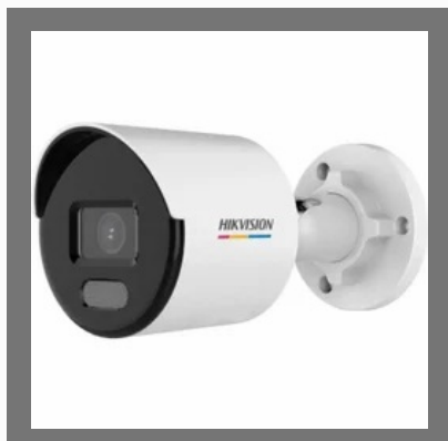
Hikvision IP Bullet CCTV Camera