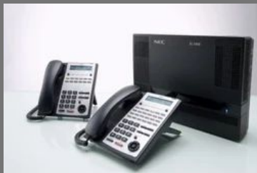
Analog EPABX Systems