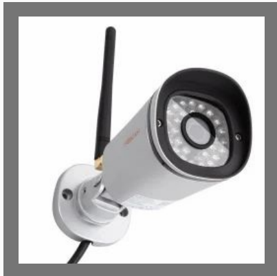
Wireless IP Camera