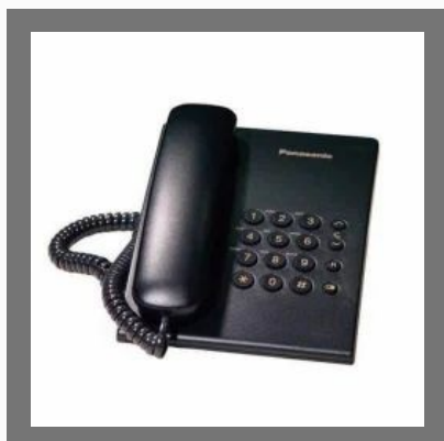
Panasonic Cordless Phone