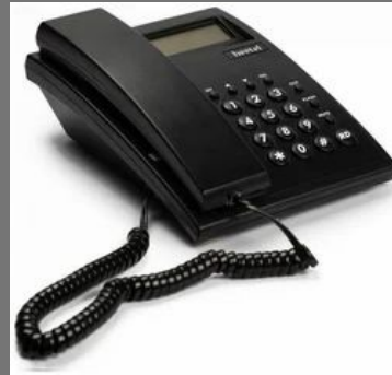
Caller ID Telephone