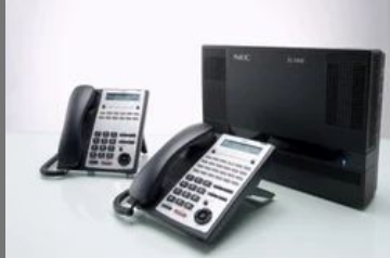
Digital Epabx System