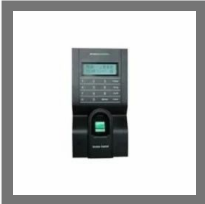
Biometrics Access Control System