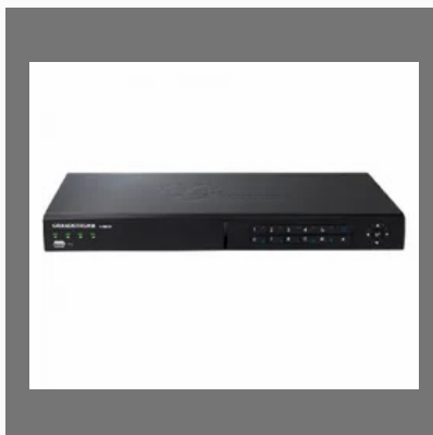
Network Video Recorder