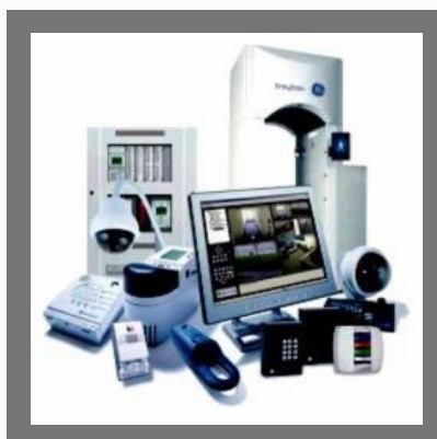
Access Control Machine