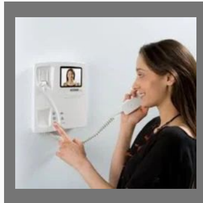
Video Door Phones