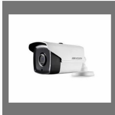
Hikvision Hd Bullet Camera