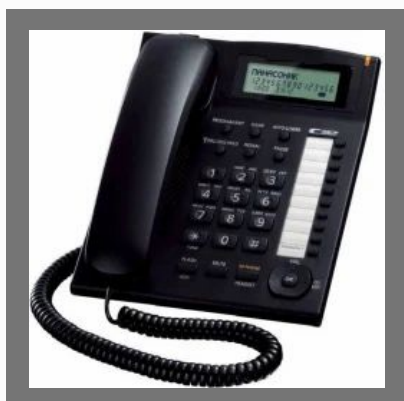
Panasonic KX-TS 880 MX