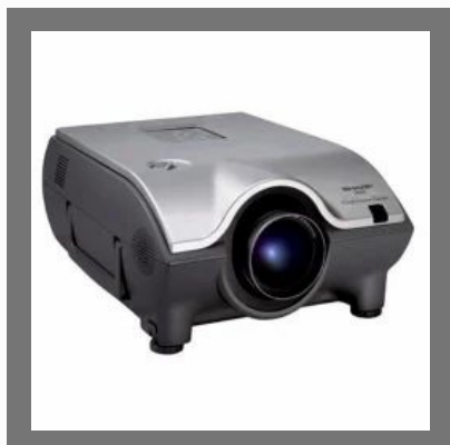
benq lcd Projectors