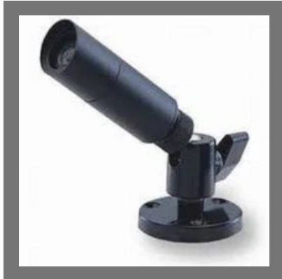
Bullet CCTV Camera