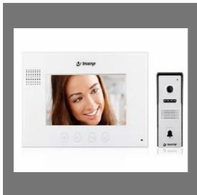
IP Video Door Phone