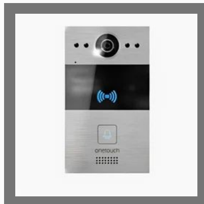
Smart Ip Video Door Phone