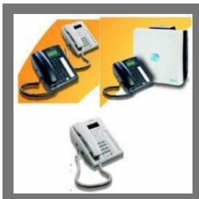
Digital EPABX Systems