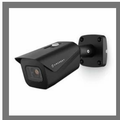
Night Vision Camera