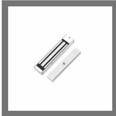
Em Locks Accessories