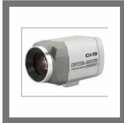
Digital Zoom Camera