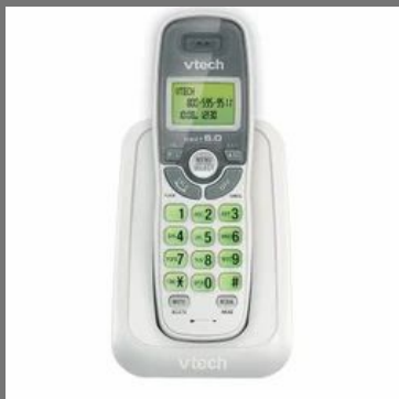
Cordless Phone System