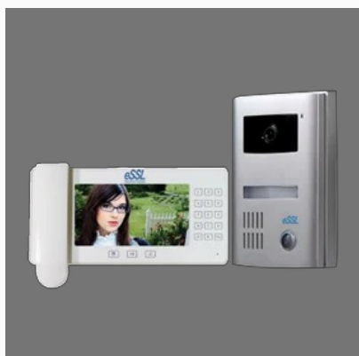
Multi Apartment Video Door Phone System