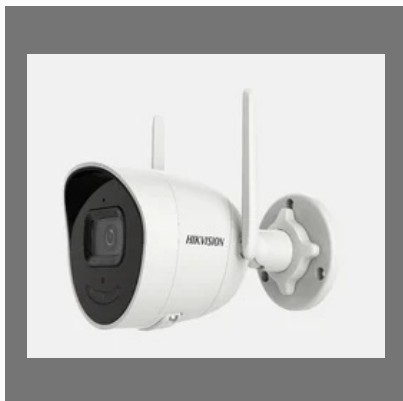
Hikvision Wireless IP Camera