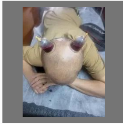
Glass Cupping Therapy