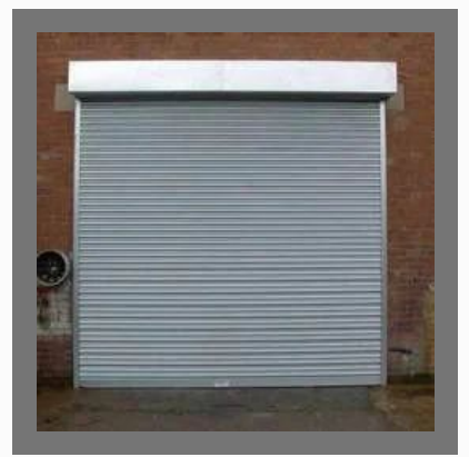
Automatic Rolling Shutter