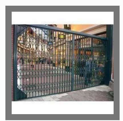
Modern Collapsible Gate