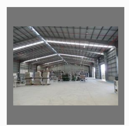
Mild Steel Structure Fabrication Shed