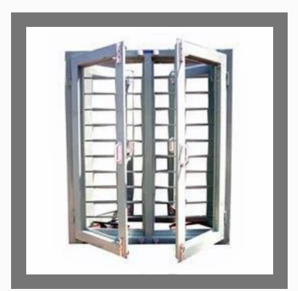
Commercial Stainless Steel Windows