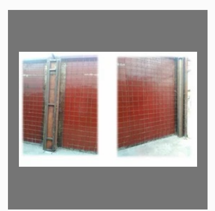
Fabricated Building Structure