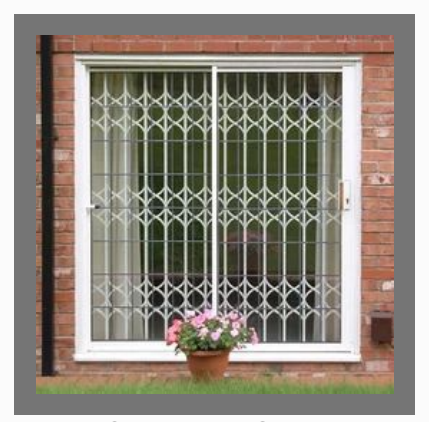
Metal Collapsible Gate