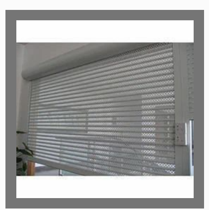
Perforated Rolling Shutter