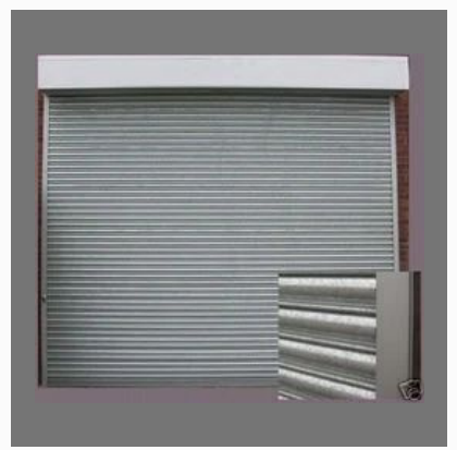
Iron Rolling Shutter