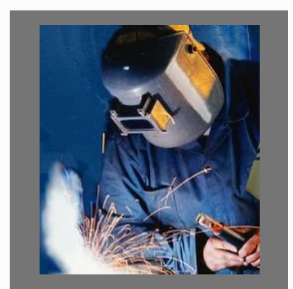
Fabrication Job Work