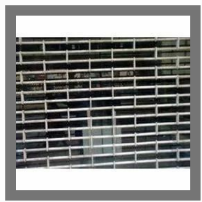
Grill Rolling Shutter