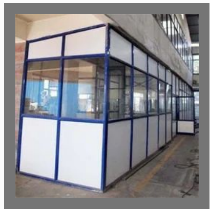
Office Aluminium Partition