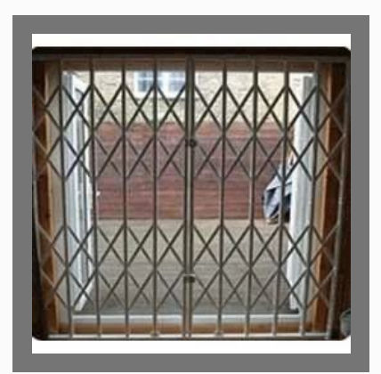
Residential Collapsible Gate