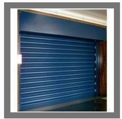
Push Pull Rolling Shutter