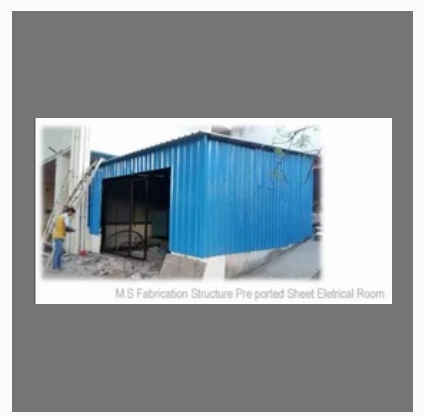
M.S Fabrication Services