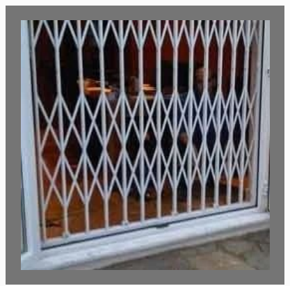
Commercial Collapsible Gate