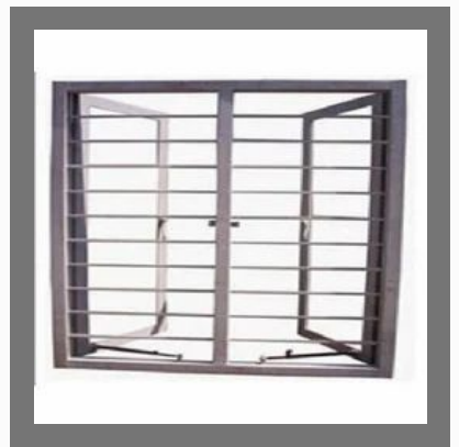
Residential Stainless Steel Windows