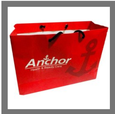
Printed Paper Carry Bag