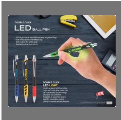
Promotional LED Pen