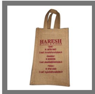
Printed Jute Bag