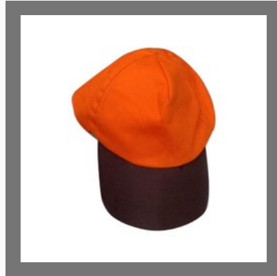
Corporate Orange And Chocolate Cap