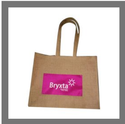
Printed Loop Handle Jute Bag