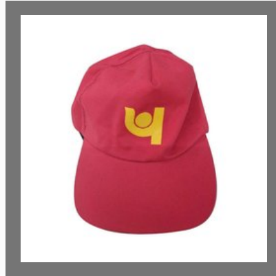
Promotional Cotton Cap