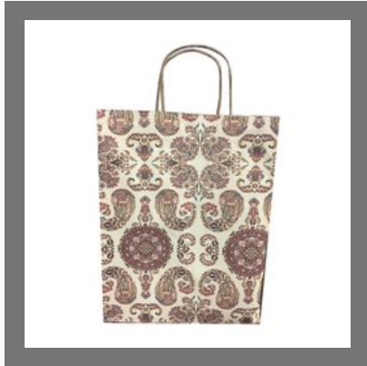
Printed Paper Bags