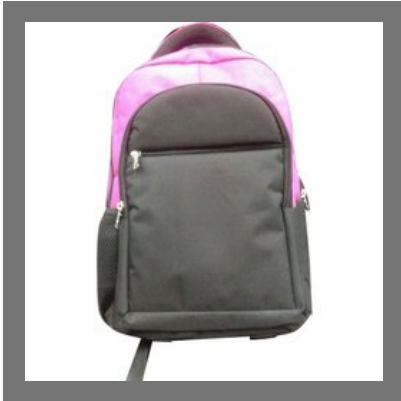
Mens Shoulder Backpack