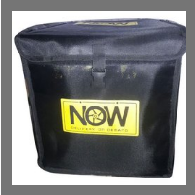
Black Insulated Food Delivery Bag