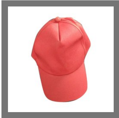
Corporate Plain Cap