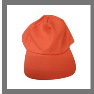
Corporate Orange Cap