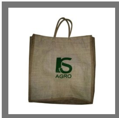
Printed Jute Handbags