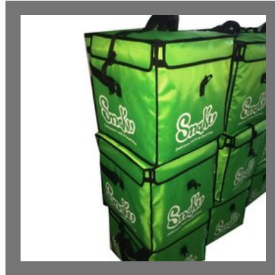
Pizza Delivery Bag