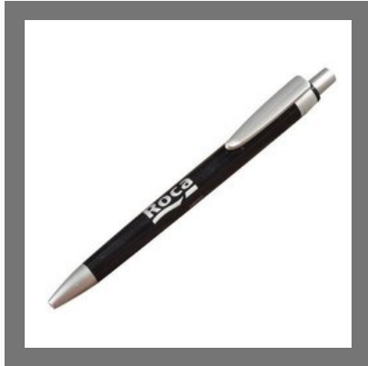
Metal Corporate Ballpoint Pen