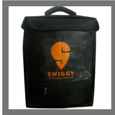
Black Food Delivery Bag