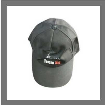
Black Promotional Caps