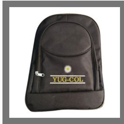
School Backpack Bag