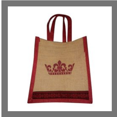
Jute Cotton Bag