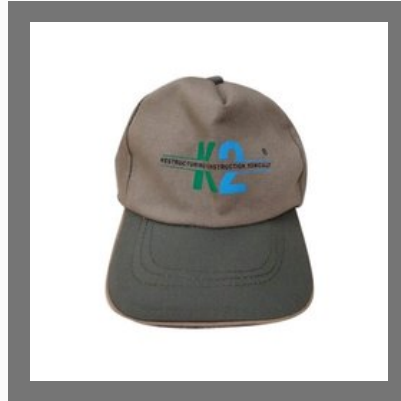
Mens Corporate Caps