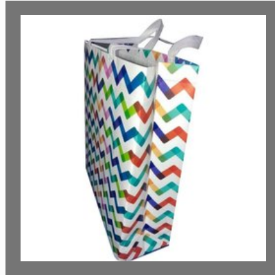
Loop Handle HDPE Printed Box Bag