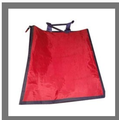
HDPE Zip Lock Bag