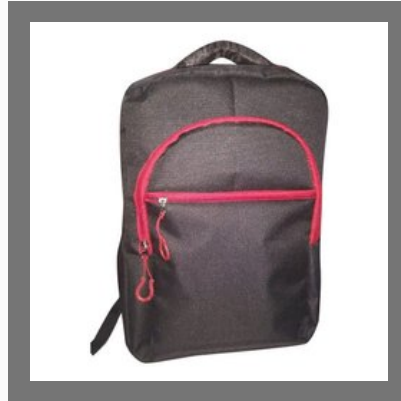
College Shoulder Backpack Bag