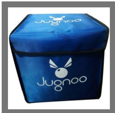
Blue Food Delivery Bag