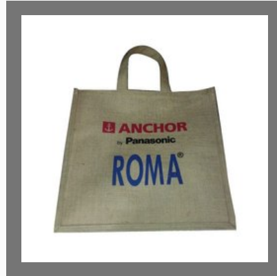
Promotional Jute Bag