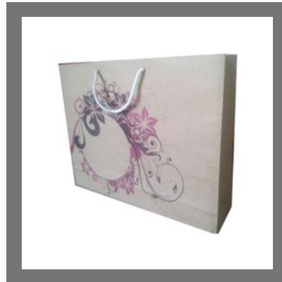
Printed Paper Gifting Bag