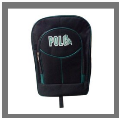
Printed School Backpack Bags