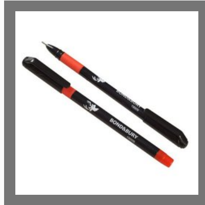
Corporate Plastic Pen