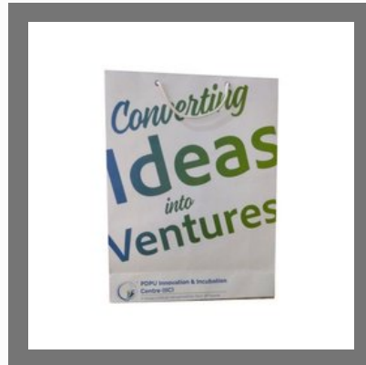
Customised Printed Paper Bag