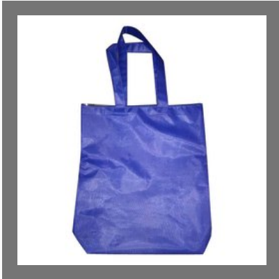
Blue Non Woven Bag