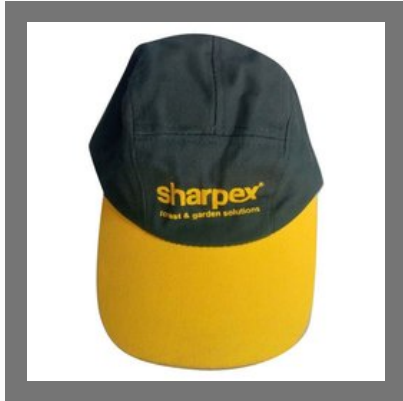
Corporate Printed Cap