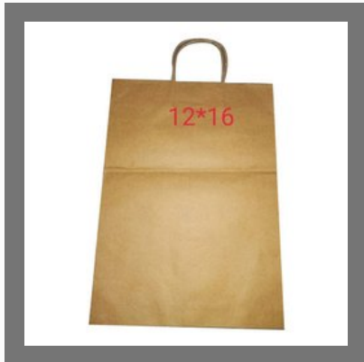
Plain Paper Carry Bag