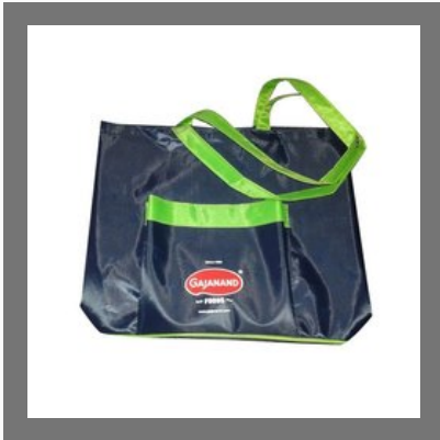
REXINE HAND BAGS