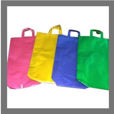
Non Woven Carry Bags