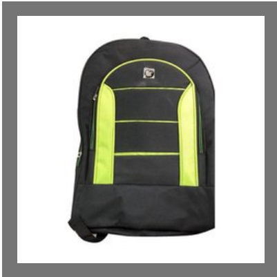
Designer School Backpack Bag