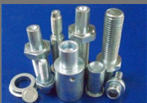
Cold Forged Components & Fasteners services