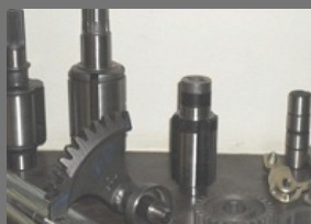
Machining Components Services