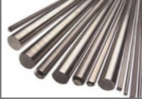
Bright Bars & Wire Rods Services