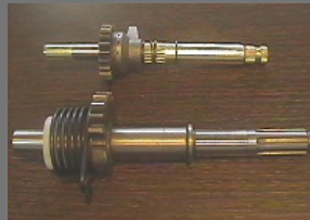
Sub Assemblies services