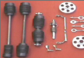
Spindles & Axles Services