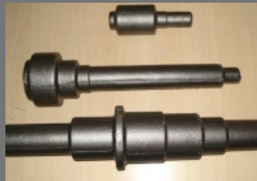
Hot Forged Components Services