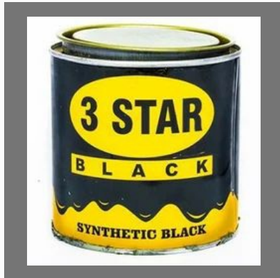
3 Star Black Enamel Paints