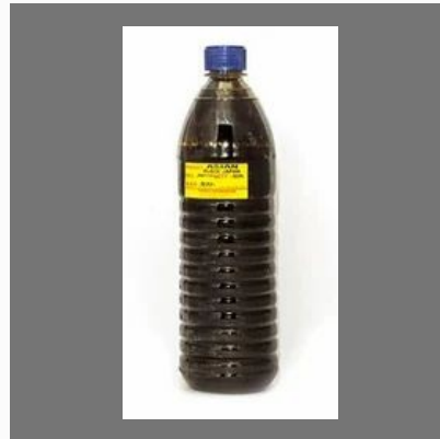
Black Japan Enamel Paints