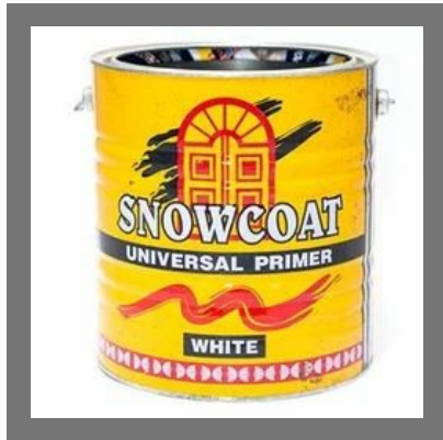
Snow Coat Primers