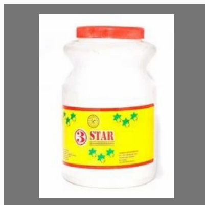
3 Star Adhesives