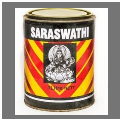
Saraswathi Wood Polish