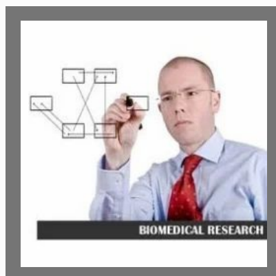
Bio-Statistics In Clinical Trials