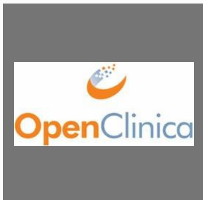
OpenClinica Electronic Data Capture Software