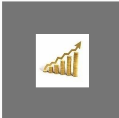
Product Development & CRM