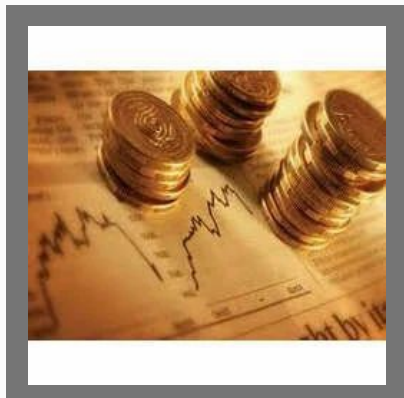
Financial Performance and Strategy Management