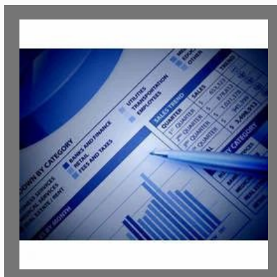
Market Research Services