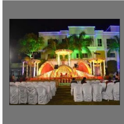
Spectacular Lighting Decorations