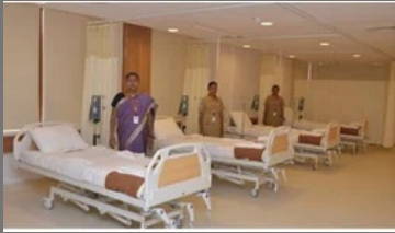
Day Care Facility