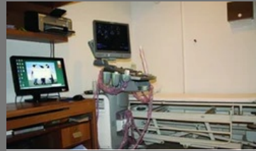
Siemens Ultrasound Machines