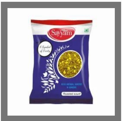
Sayyam Roasted Mix Mukhwas Saunf, Dhanadal , Magaj Seeds