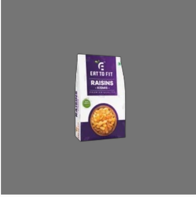
Eat To Fit Kismish