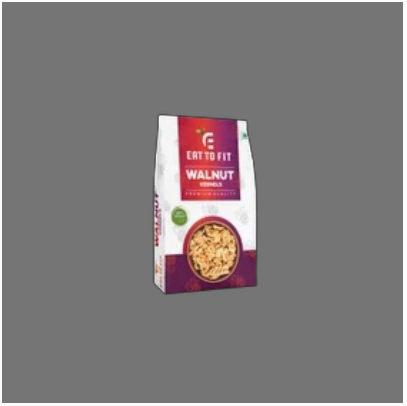
Eat To Fit Walnut Kernals