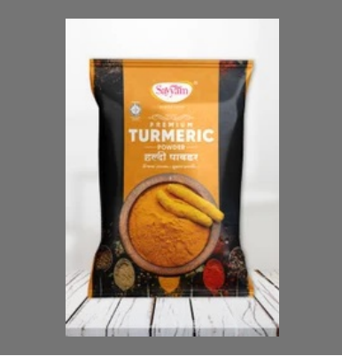
Sayyam Turmeric Powder