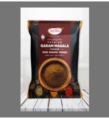
Sayyam Garam Masala Powder