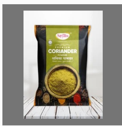
Sayyam Coriander Powder