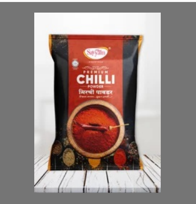
Sayyam Chilli Powder