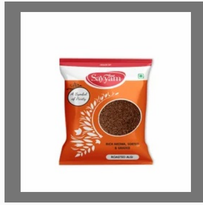
Sayyam Roasted Alsi