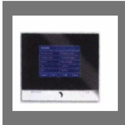
Eib Touch Panel Smart Touch