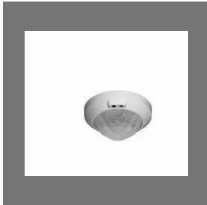
Eib Presence Detector