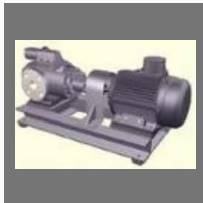
Horizontal Foot Mounted