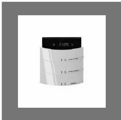
Triple Operating Element