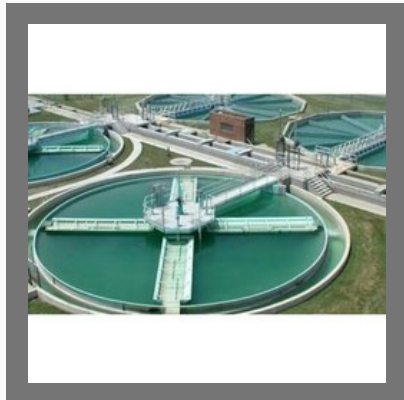
Effluent Treatment Plants