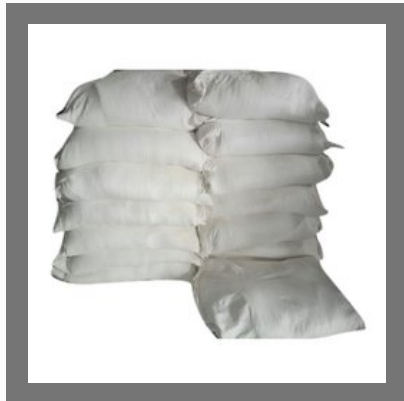
Hydrated Lime Powder