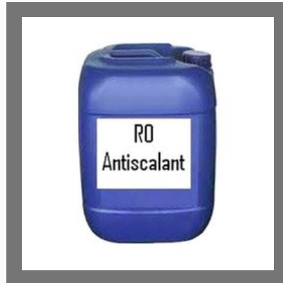
RO Antiscalant Liquid