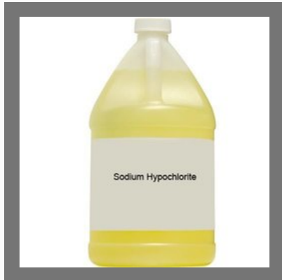
Sodium Hypochlorite Liquid