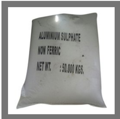
Aluminum Sulphate Non Ferric Powder