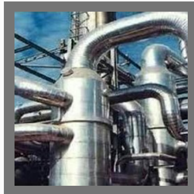
Cold Insulation Services