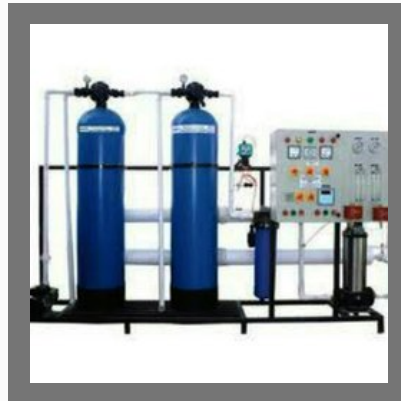
RO Water Plant