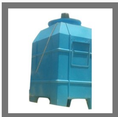
FRP Cooling Tower