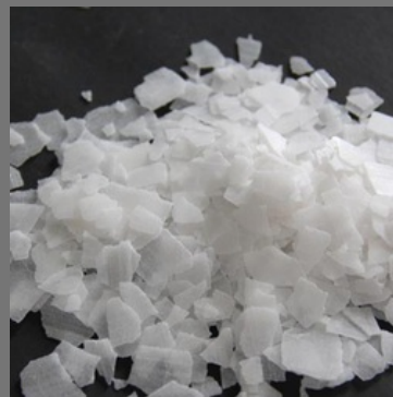
Caustic Soda Flakes