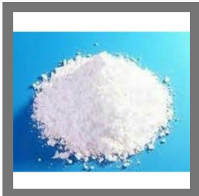
White Lime Powder