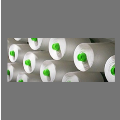
Textured Sewing Thread