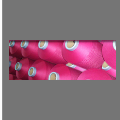
Textured Polyester Yarns