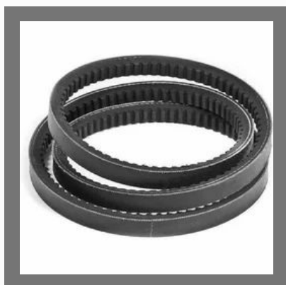
Fenner V Belt