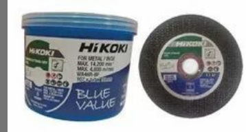
796245z Cut Off Wheel - Blue Value. Hitachi - Hikoki