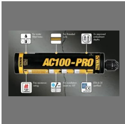
Dewalt AC100-PRO Chemical Anchor