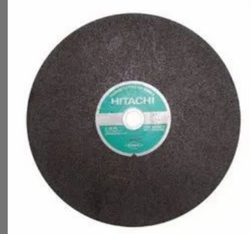
702114Z Cut Off Wheel, Hitachi - HiKOKI