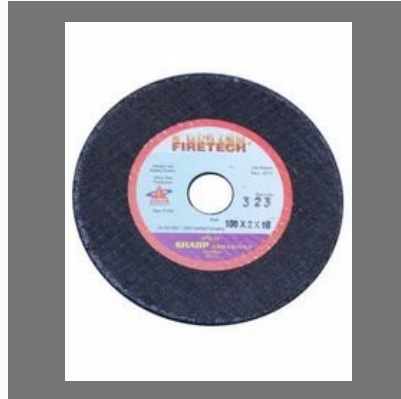
Firetech Cutting Wheel