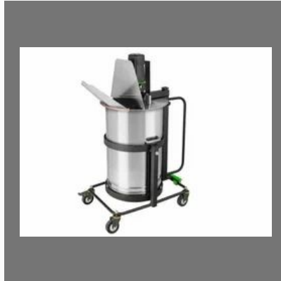
FoodMix 1800 I