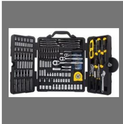
Mechanical Hand Tools