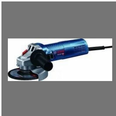
Bosch Angle Grinder GWS 900-100