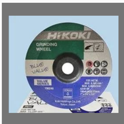
796248, 7-Inch(6.7mm) Blue Value Grinding Wheel, Hitachi - HiKOKI