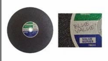
796243z Cut Off Wheel