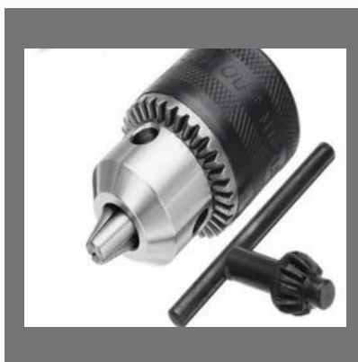
Professional Metal Chuck