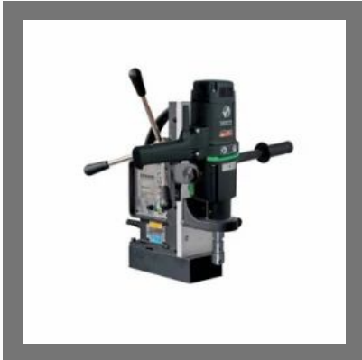
Magnetic Drill Stand B 32.1