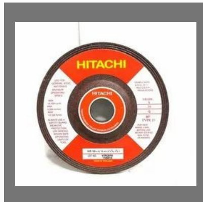
Hitachi Grinding Wheel-AG4-701040