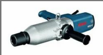
BOSCH IMPACT WRENCH GDS 30