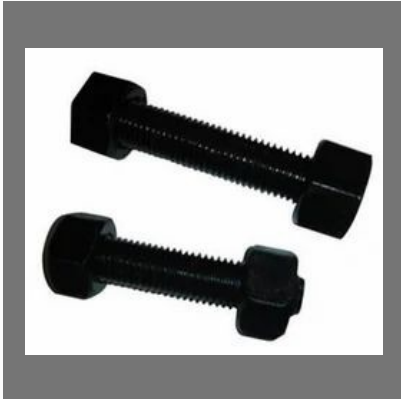
B7 Stud Bolts