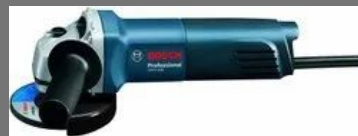
Bosch Small Angle Grinders GWS 600