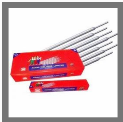
Ador Welding Rod