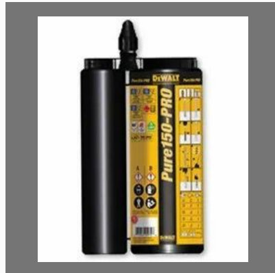
DeWalt Pure150-PRO Chemical Anchor