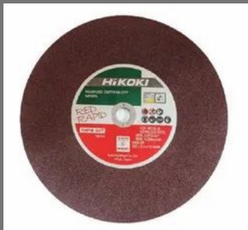
796244Z Cut Off Wheel, Red Rapid, Hitachi - HiKOKI