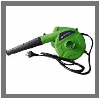
Air Blower EB 600