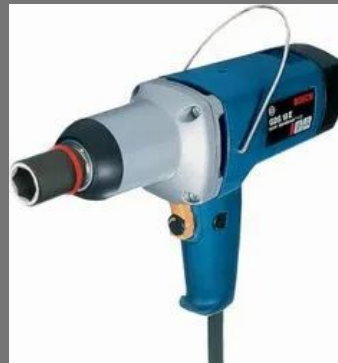
Bosch Impact Wrench GDS 18 E