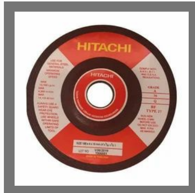
Hitachi Grinding Wheel