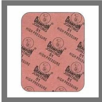
Champion Gasket Sheet