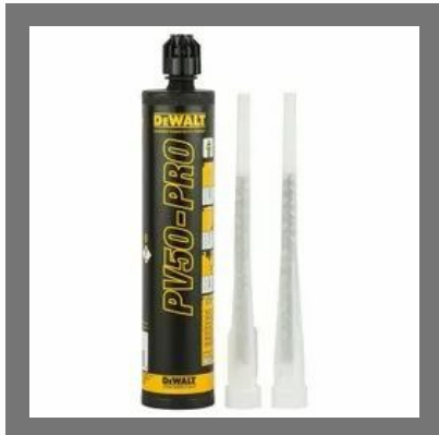
Dewalt PV50-PRO Polyester Adhesive