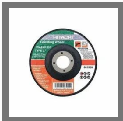
701090Z, 9-Inch Grinding Wheel, Hitachi - Hikoki - Ag9