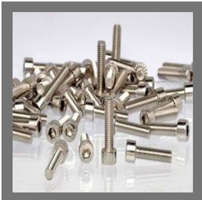
SS316 Bolt Nut