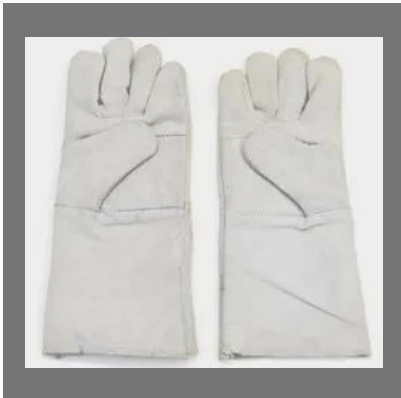
Craft Leather Hand Gloves