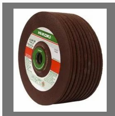
701070AZ 7 Inch Grinding Wheel, Black, Hitachi - HiKOKI