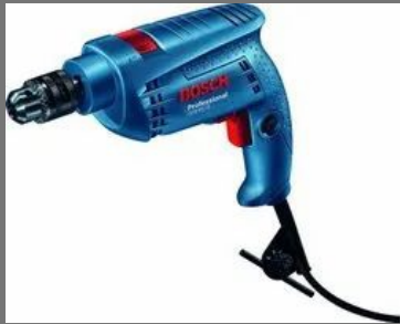
Bosch Impact Drill Machine GSB 501