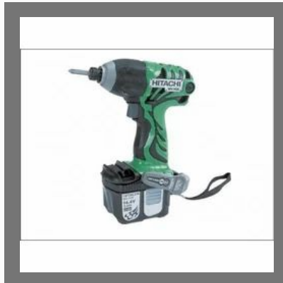
Hitachi Power Tools