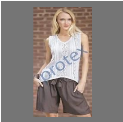
Light Summer Knit Tops