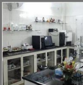
Laboratory (Setup For Drinking Water)