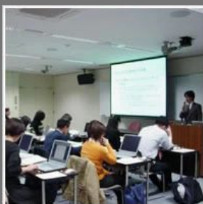
Management System Training Program