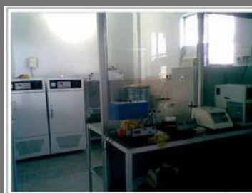
Laboratory Setup & Lab Equipments