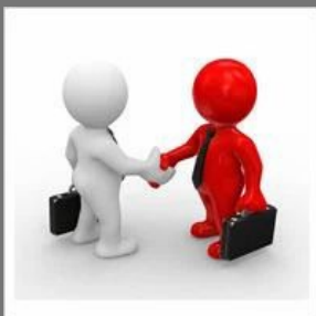
Analytical Testing Training