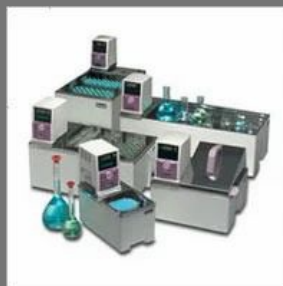
Laboratory Setup Services