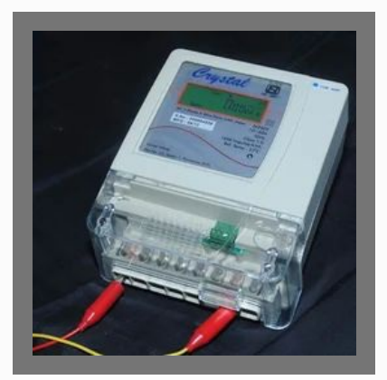
Prepaid Energy Meter