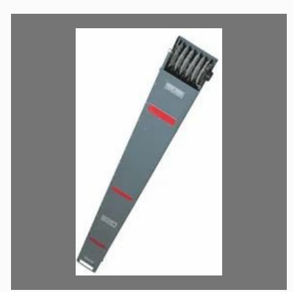
Busbar Trunking System