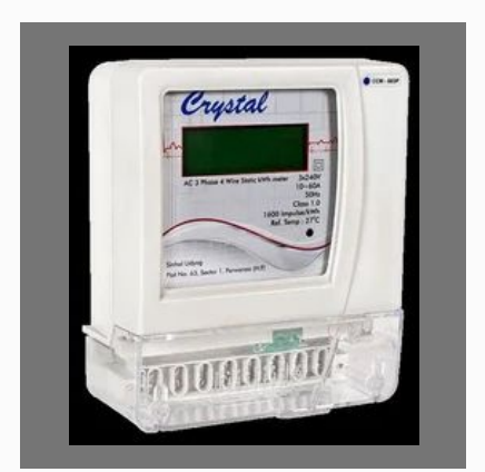
Three Phase Electric Meter