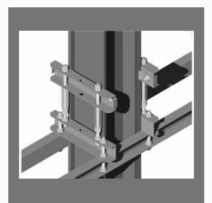
Busbar Trunking System