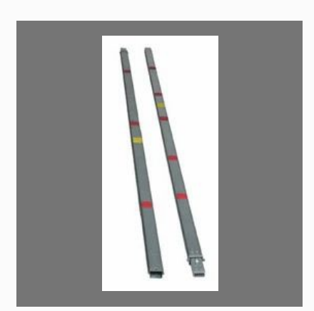
Busbar Trunking System