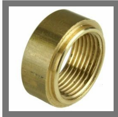
Brass Bearing Bush