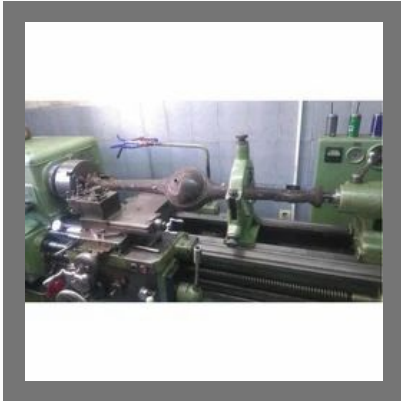
Lathe Machine Job Work