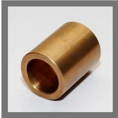
Gunmetal Bearing Bush