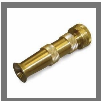
Industrial Copper Nozzle