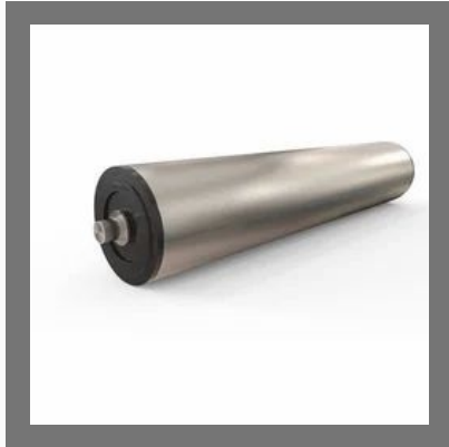
Industrial Conveyor Roller