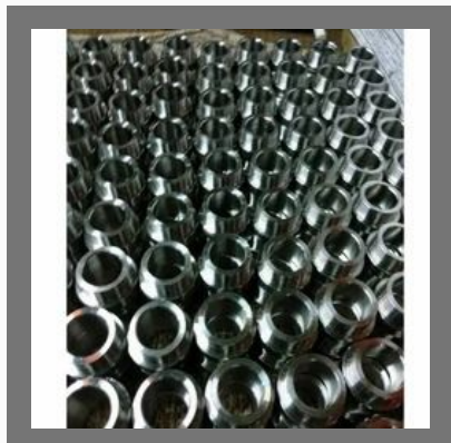
Roller Bearing Bush