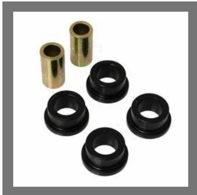
Industrial Bearing Bush