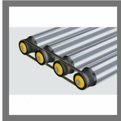
Conveyor Power Roller