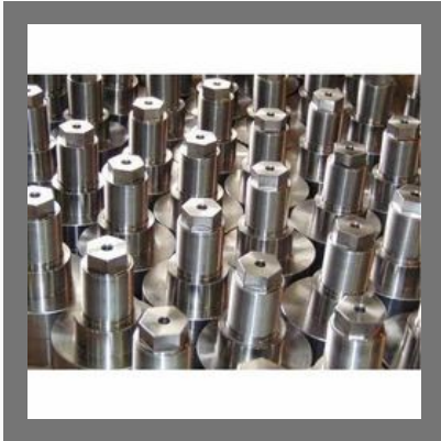
CNC Lathe Machine Job Work