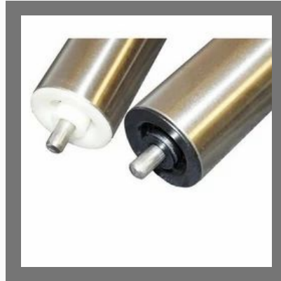
Stainless Steel Conveyor Roller