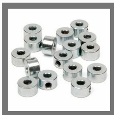
Robotics Shaft Collar