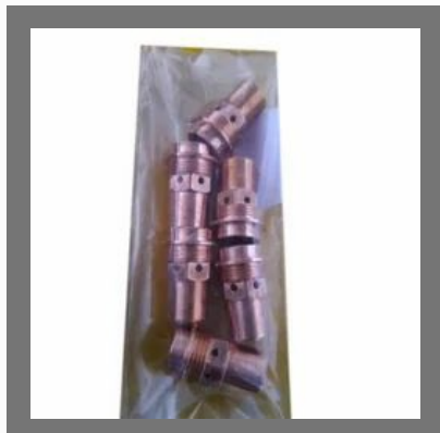
Robotic Welding Machine Nozzle