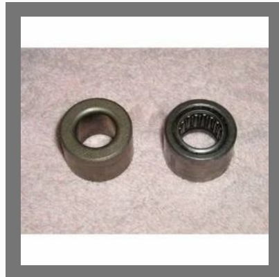
Stainless Steel Bearing Bush