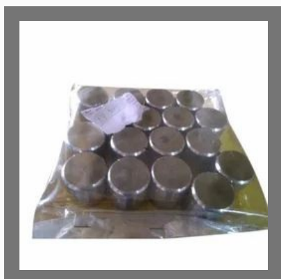
Round Automotive Piston