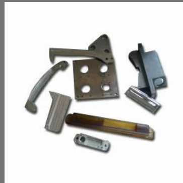
Precision Milling Components