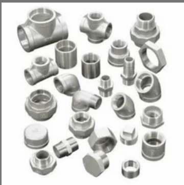
Precision Machined Components