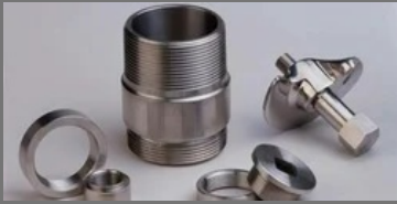
Precision Machine Components