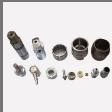
CNC Turned Components