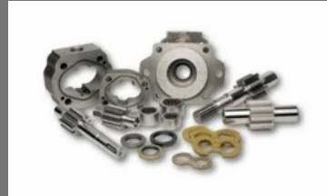
Precision Machine Components