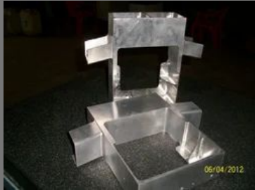
Rear Mounting Blocks