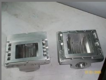
Laser Spot Camera