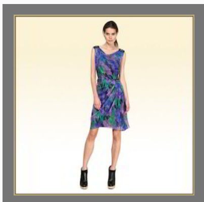
Ladies Short Dress