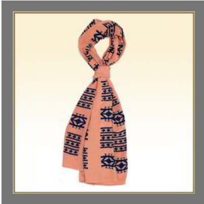
Block Print Scarf