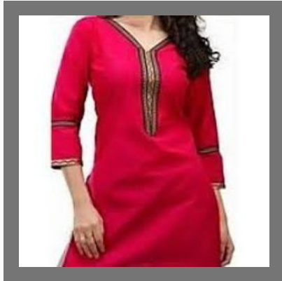
Casual Ladies Kurtis