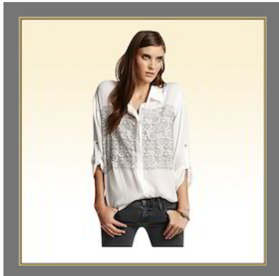
Designer Ladies Shirt