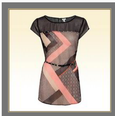
Day Wear Dress