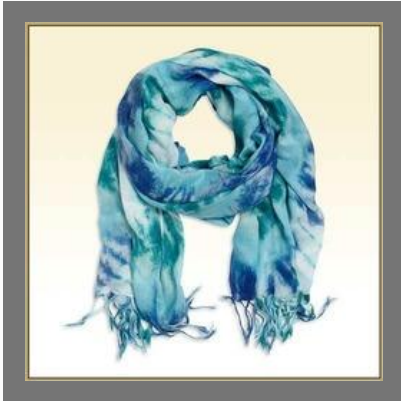
Tie Dye Scarf