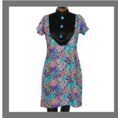
Printed Cotton Kurtis