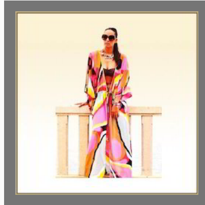
Cotton Printed Kaftan