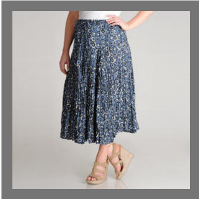
Women Cotton Skirts