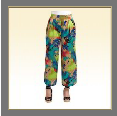
Designer Ladies Pant