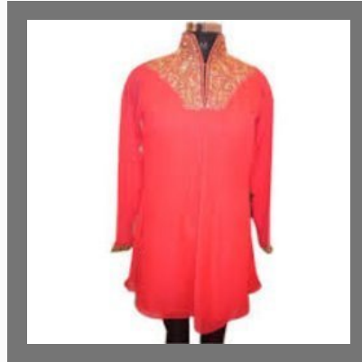
Embroidered Georgette kurtis