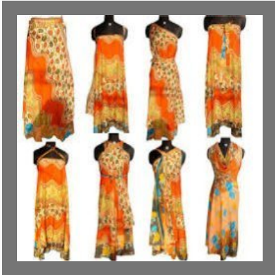
Multi Wear Wrap Skirts