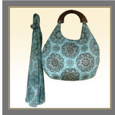
Bag & Scarf Set