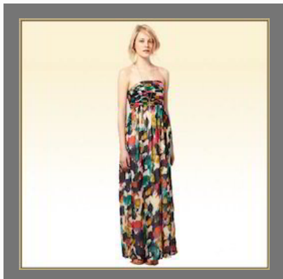
Designer Maxi Dress