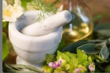
Homeopathic Kit For Children