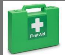
First Aid Homoeopathic Kit