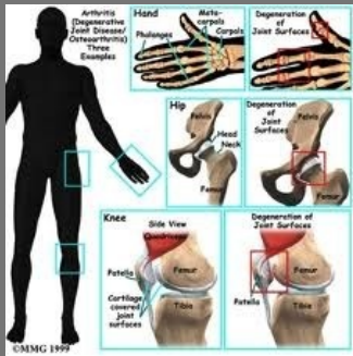
Arthritis Medicine Course