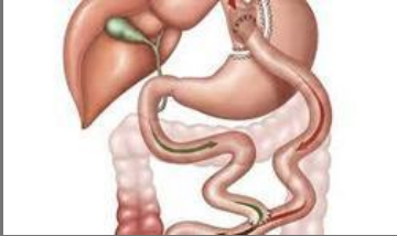
Laparoscopic Mini Gastric Bypass