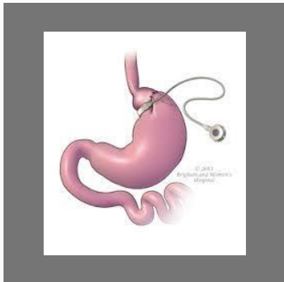
Laparoscopic Adjustable Gastric Band