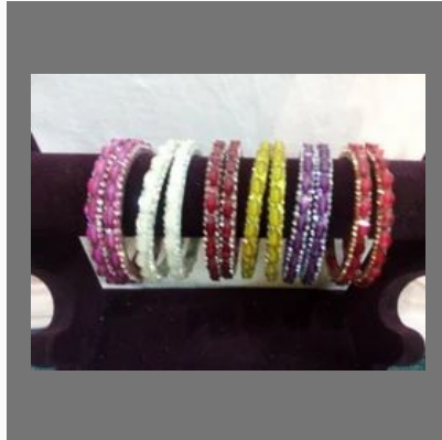
Chandni- Glass Bangles