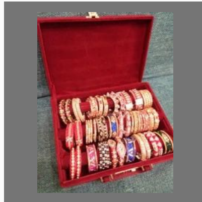
Wedding Bangle Set