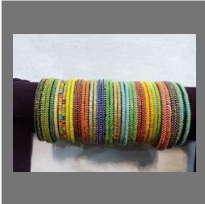
OM- Glass Bangles