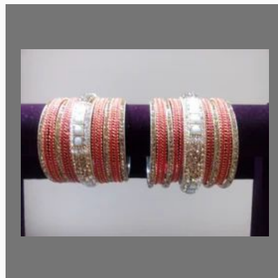
Designer Glass Bangles