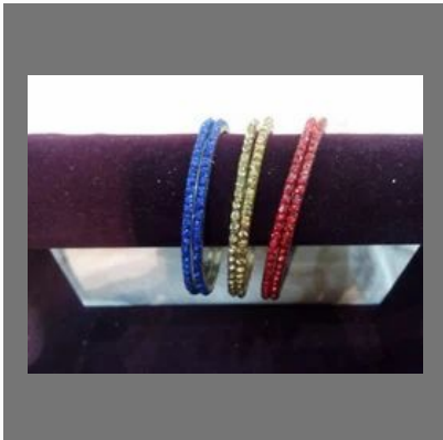
Josh- Glass Bangles