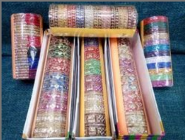
Metal Designer Bangles