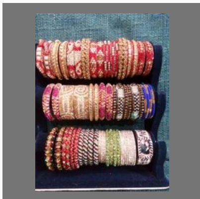
Metal Designer Bangles