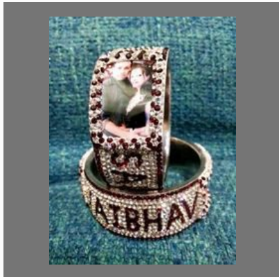
Photo Embossed Bangles