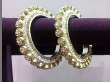
Exclusive Metal Bangles