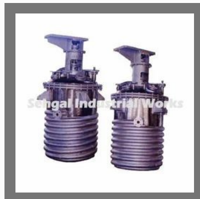
SS Jacketed Tank