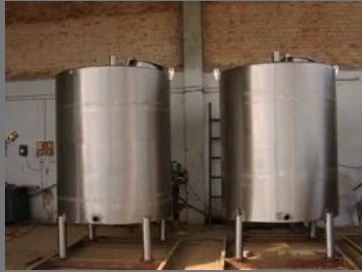
Pulp Storage Tank