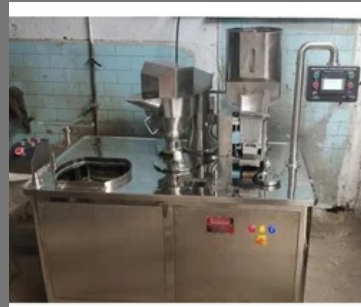
Semi Automatic Capsule Filling Machine