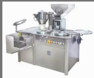
Capsule Filling Machine