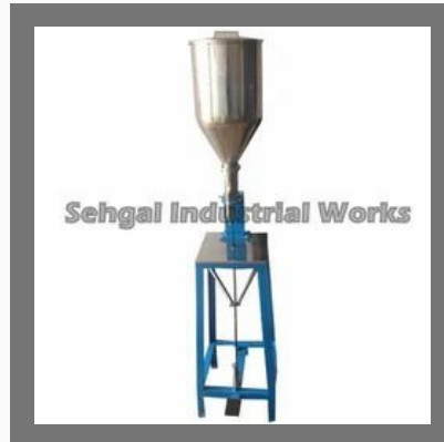
Foot Operated All Purpose Filling Machine