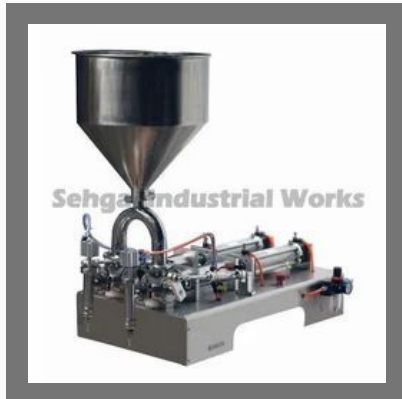
Liquid Soap Filling Machine