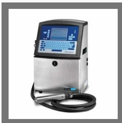
Batch & MRP Printing Machine