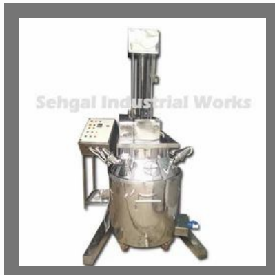
Planetary Mixer Machine