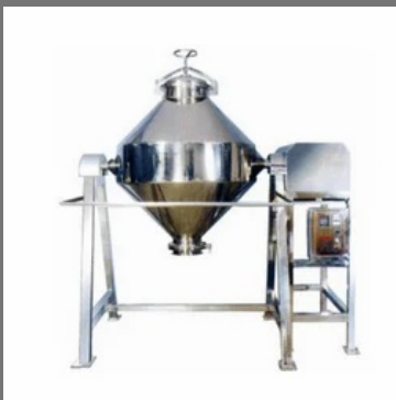
Double Cone Blender