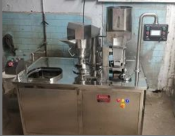
Semi Automatic Capsule Filling Machine (SA9)