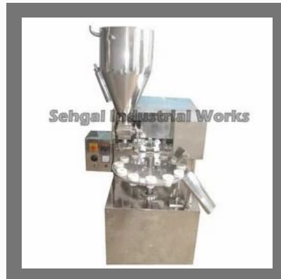
Automatic Laminated Tube Filling Machine