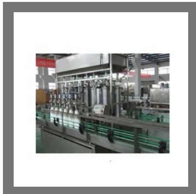
Liquid Filling Machine