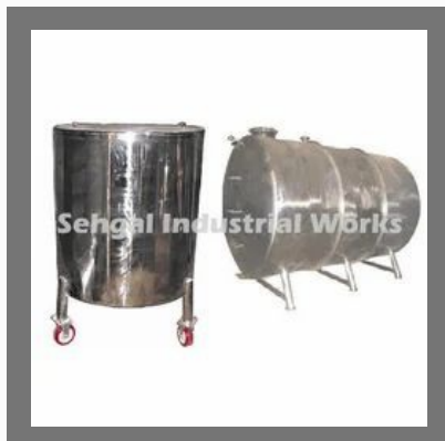
SS Mixing and Storage Tank