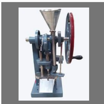
Tablet Making Machine - Multi Punch