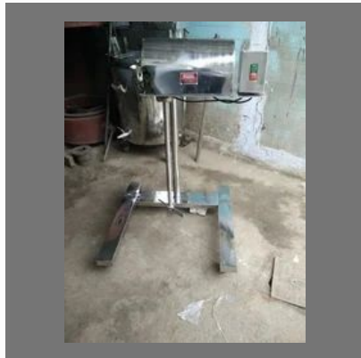
Slow Speed Stirrer