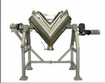
Rota Cube Blender