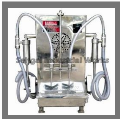
Volumetric Liquid Filling Machine