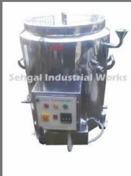
Double Jacketed Heated Tanks