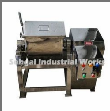
Powder Mass Mixer