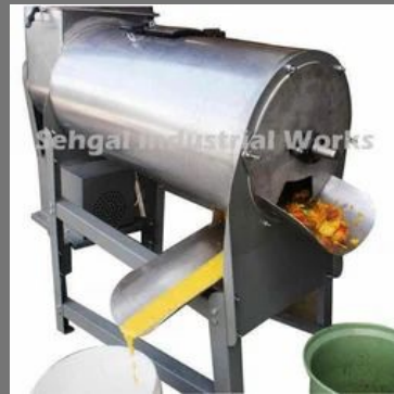
Fruit Pulper Machine