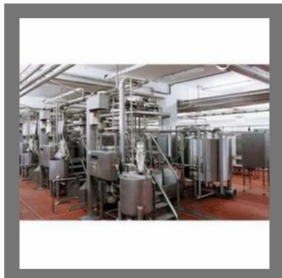
Food Processing Plant