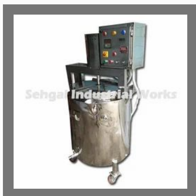
Double Jacketed Tank With Stirrer