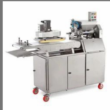
Food Processing Machine