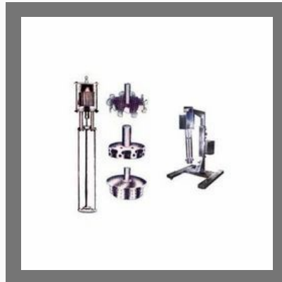
SS Food Emulsifiers