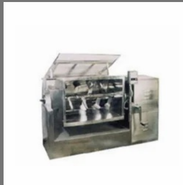
Powder Mass Mixer