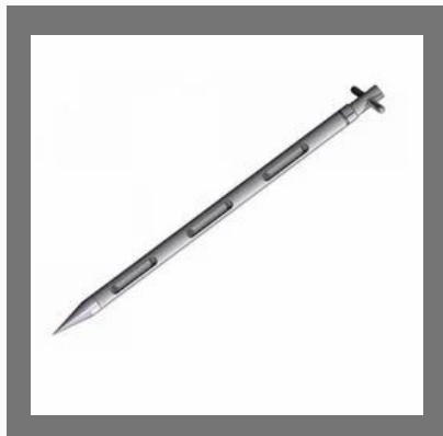
Powder Sampling Rod