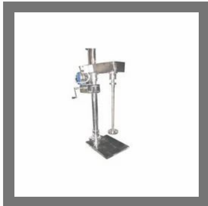
High Speed Dissolver