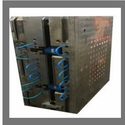
Hot Runner Plastic Mold