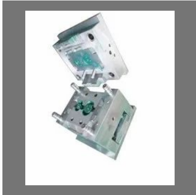
Plastic Cap Unscrewing Mould