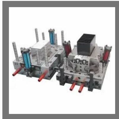
Stainless Steel Battery Plastic Injection Mould