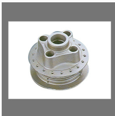
Pressure Die Castings