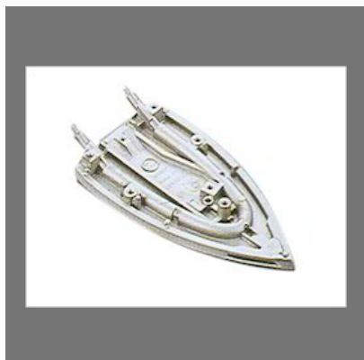
Iron Cover Die Castings