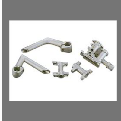
Aluminium Pressure Die Casting