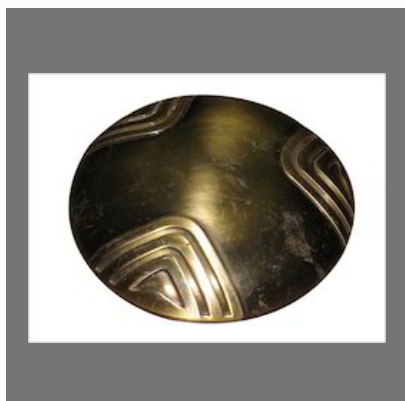
Pressure Die Casting