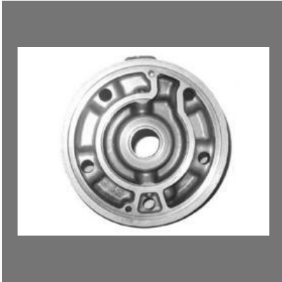
Aluminium Die Castings