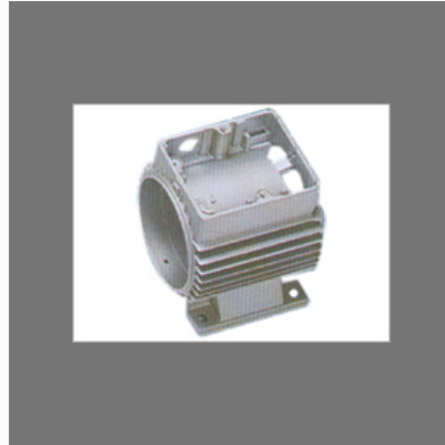
Motor Cover Die Castings