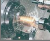
CNC Machined Component