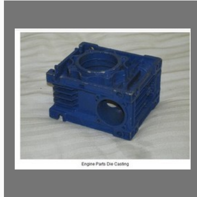
Engine Parts Die Casting