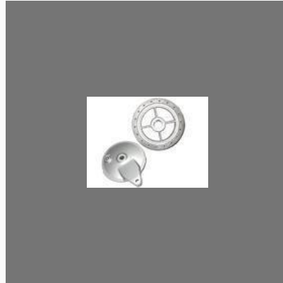
Brake Drum Die Casting