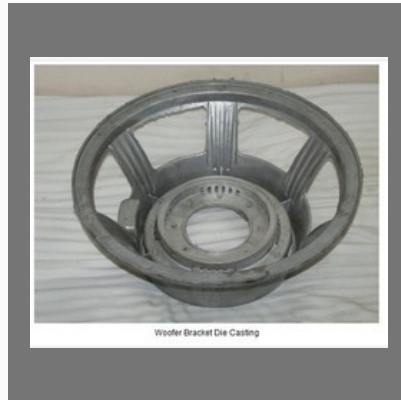
Woofer Bracket Die Casting