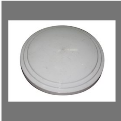
Fan Cover Die Castings