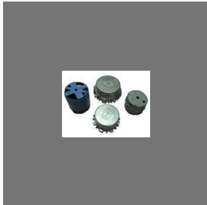
Fan Body Cover Casting