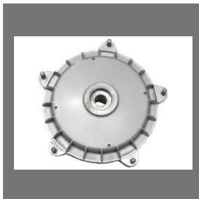
Break Drum For Bajaj Chetak