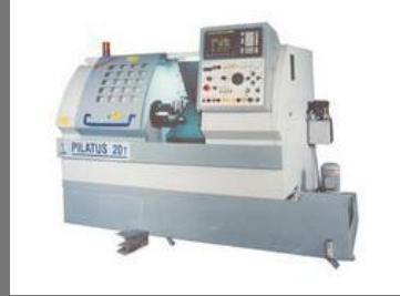
CNC Turning Machine