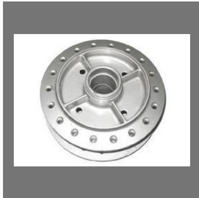
Hero Honda Break Drum