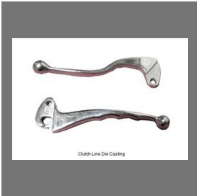
Clutch Line Die Casting