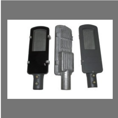
Led Street Light Housing