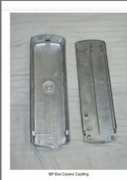
BP Box Covers Casting