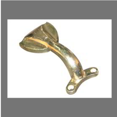
Pressure Die Castings