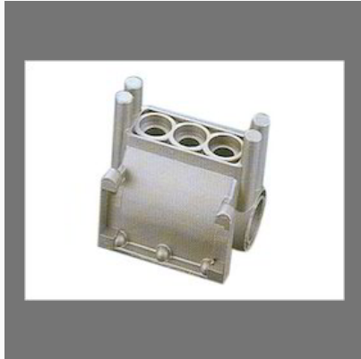
Gravity Die Casting Components