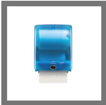
HRT ROLL DISPENSER