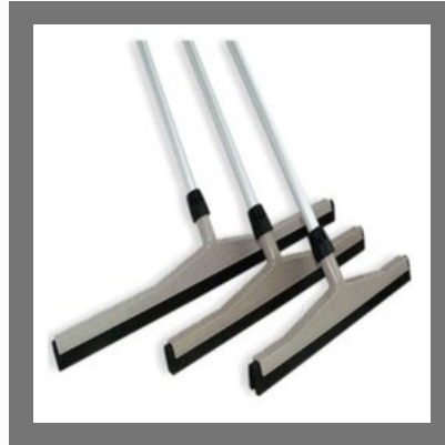
Grey Floor Wiper