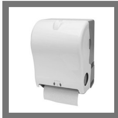
HRT ROLL DISPENSER