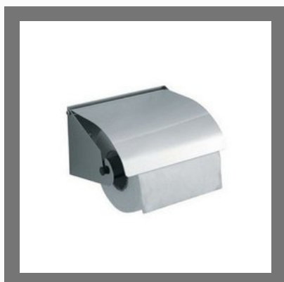
Tissue Roll Dispenser