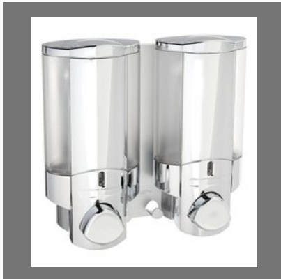
Soap Dispenser Double