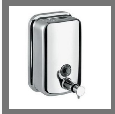
Stainless Steel Soap Dispenser 1000 MI