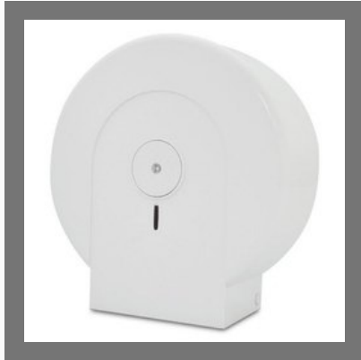
Tissue Roll Dispenser