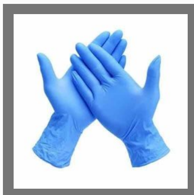
Examination & nitril surgical gloves pkts