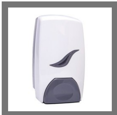
Soap Dispenser WF064 500ML