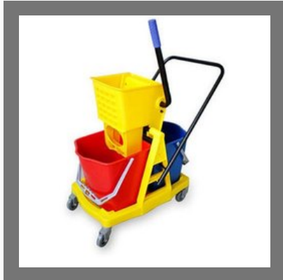
Wringer Trolley Double Bucket