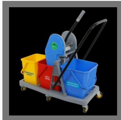
Tripple Bucket Mop Wringer Trolley