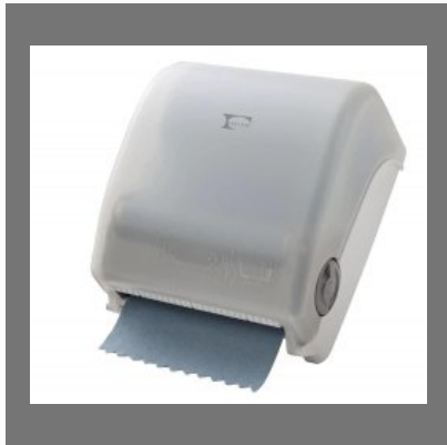
HRT ROLL DISPENSER