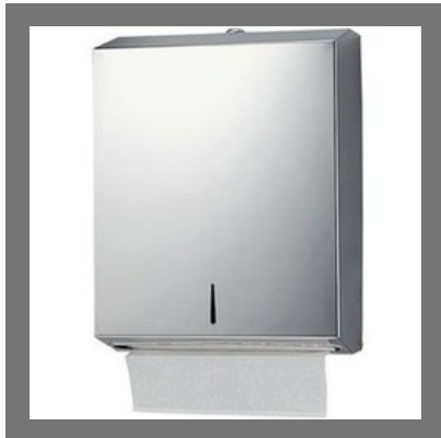
Fold Paper Dispenser