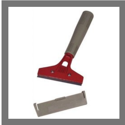
PLASTIC FLOOR SCRAPER