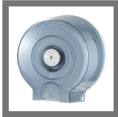
Tissue Roll Dispense