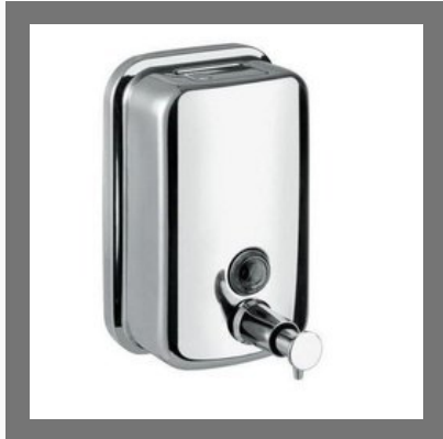
Ss Soap Dispenser 800 MI