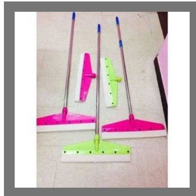
Blue Floor Wiper Fom