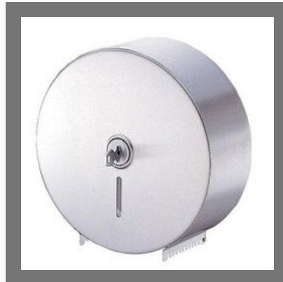
SS Jumbo Roll Dispenser