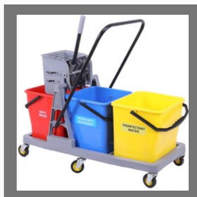
Tripal Buckets Trolley