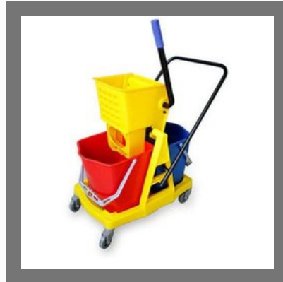
Wringer Trolley Double Bucket