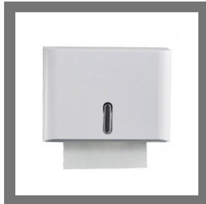
Fold Paper Dispenser