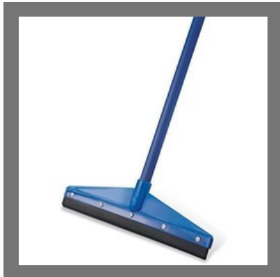
Blue Floor Wiper Foam