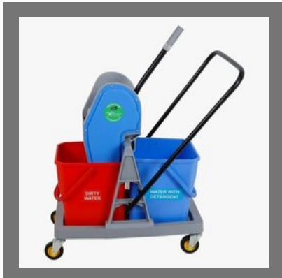
Wringer Trolley Double Bucket