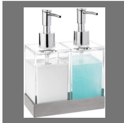
Double Liquid Soap Dispenser