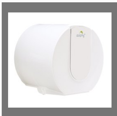
Jumbo Roll Dispenser(518)