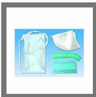
Surgical Mask and Cap