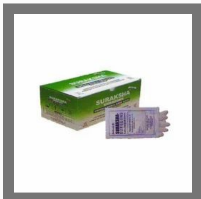
Latex Surgical Hand Gloves