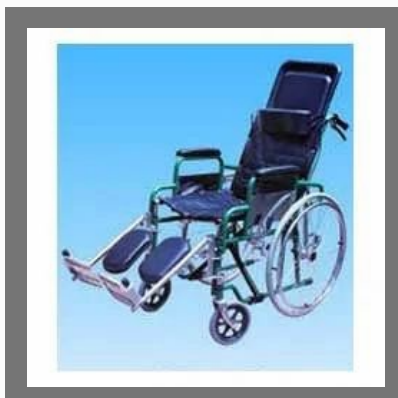
Reclining Wheel Chair