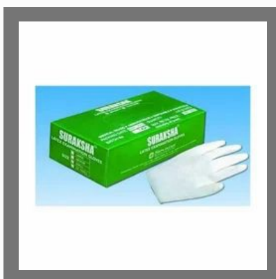
Latex Examination Glove