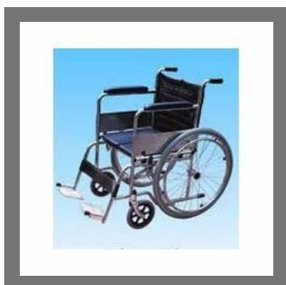
Folding Wheel Chair