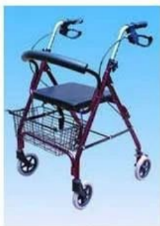
Handicap Walker with Brake