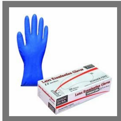
High Risk Gloves