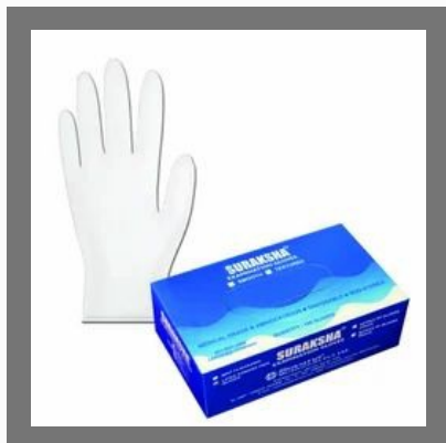
Latex Examination Gloves