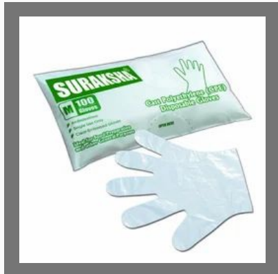
Cast Polyethylene (cpe) Glove