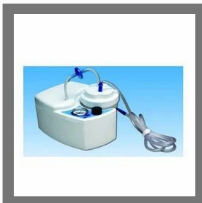
Portable Suction Unit