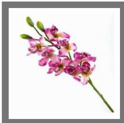
Cymbidium Flower Stick