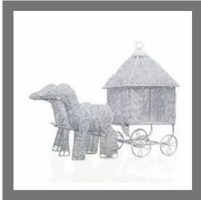
White Horse Cart