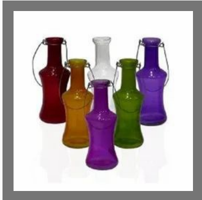
Multicolor Fancy Bottles