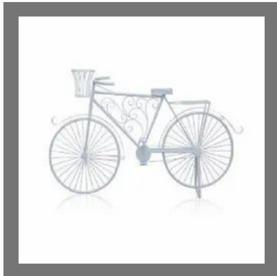
White Decorative Cycle