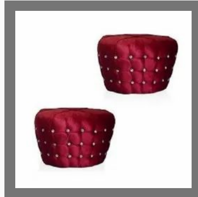
11080 Maroon Circular Puffy