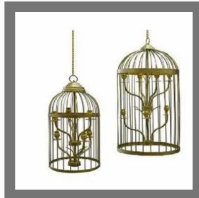
Golden Light Holder