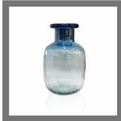
7235 Blue Glass Vase