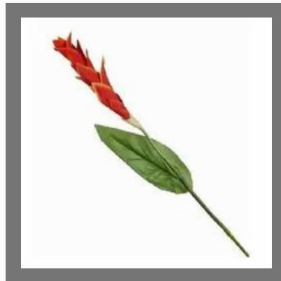
Red Ginger Lily Stick