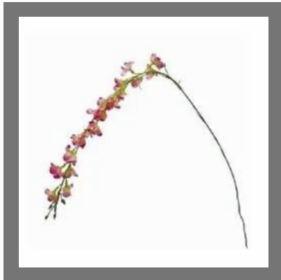
Decoration Orchid Hanging Stick