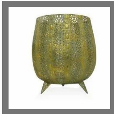
7166G Green Metal Bucket