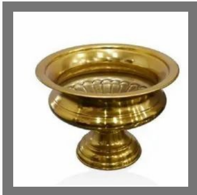
4347 Golden Bowl