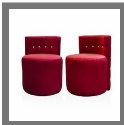
11097 Red Puffy Chair