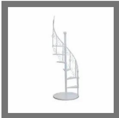
IR103 White Metal Staires