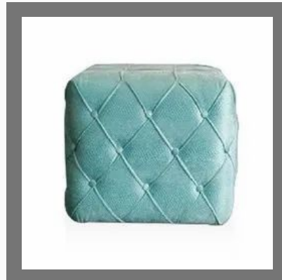
11079 Blue Square Puffy