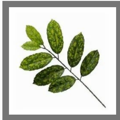
Patabahar Leaf Bunch