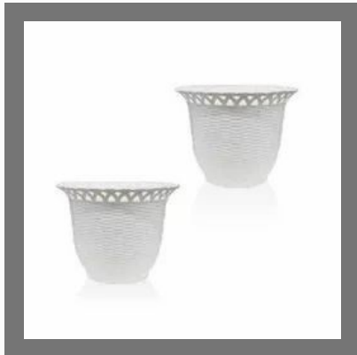
GP-A3633 White Basket