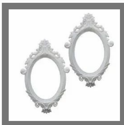
6797 White Mirror Frame