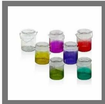
7171 Glass Jar