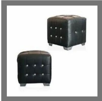
11086 Square Black Puffy