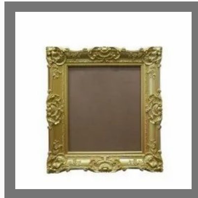
6793 Square Frame