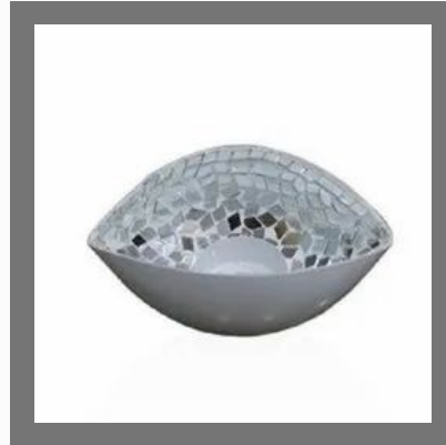
4412 Oval Candle Stand