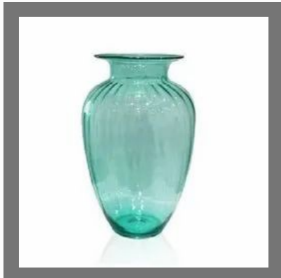
7232 Green Glass Vase