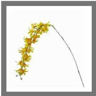
Yellow Orchid Hanging Stick