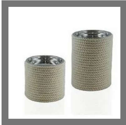
Cylindrical Candle Stand