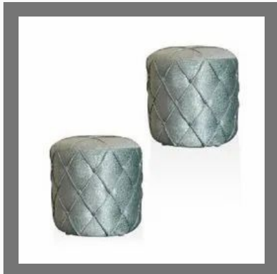
11088 Blue Round Puffy