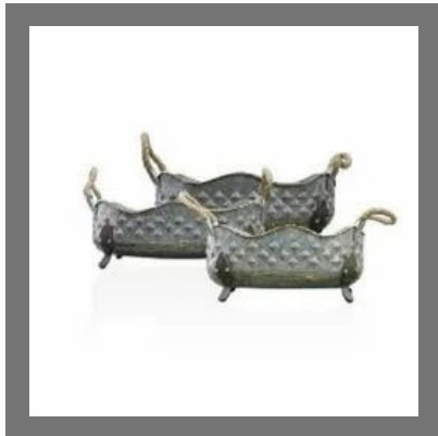
4160 Silver Basket