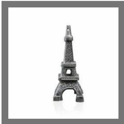
Decorative Eiffel Tower