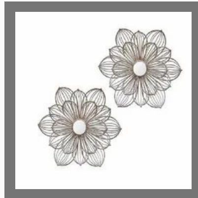
Flower Wall Hanging