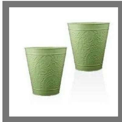
Green Metal Basket