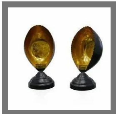
Semicircular Candle Stand With Base