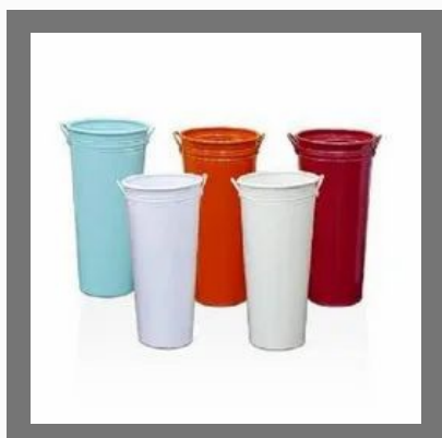
4408 Colorfull Metal Bucket