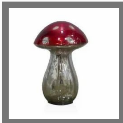
Decorative Glass Mushroom