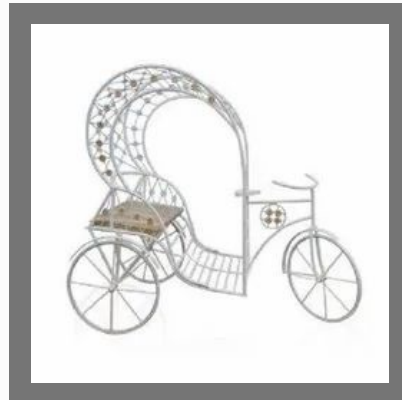
4261 Metal Rikshaw