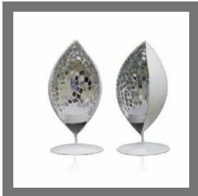
4411 Candle Stand