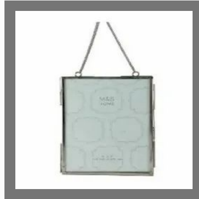
Fancy Photo Frame