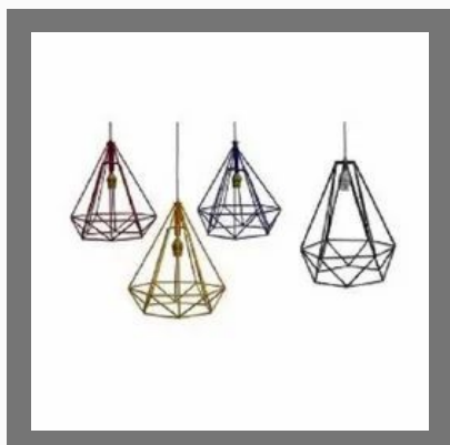
Hexagon Light Holder