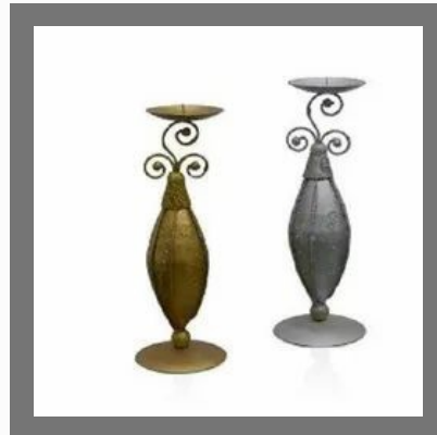
21418 Fancy Candle Stand