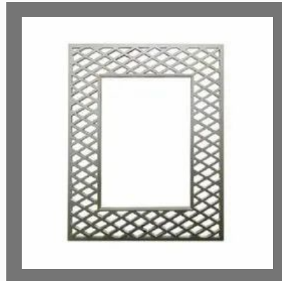
6745 Square Net Frame