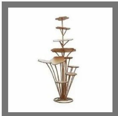
4433 Cake Stand